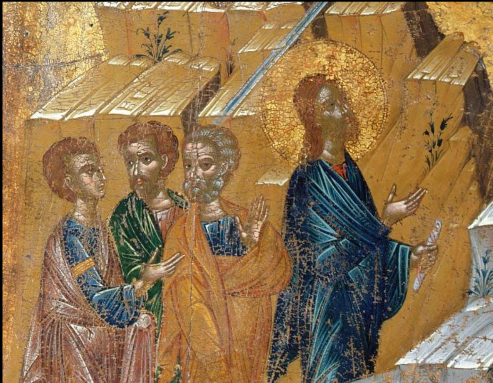
Transfiguration of Christ, detail -- Early 17 th c. Icon, Benaki Museum, Athens, Greece