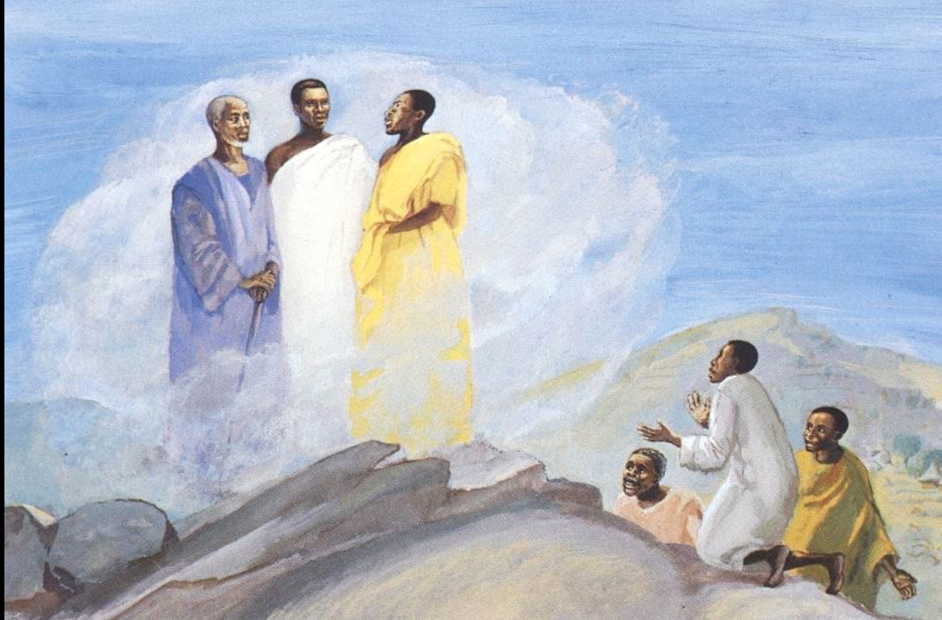
Transfiguration -- JESUS MAFA, Cameroon