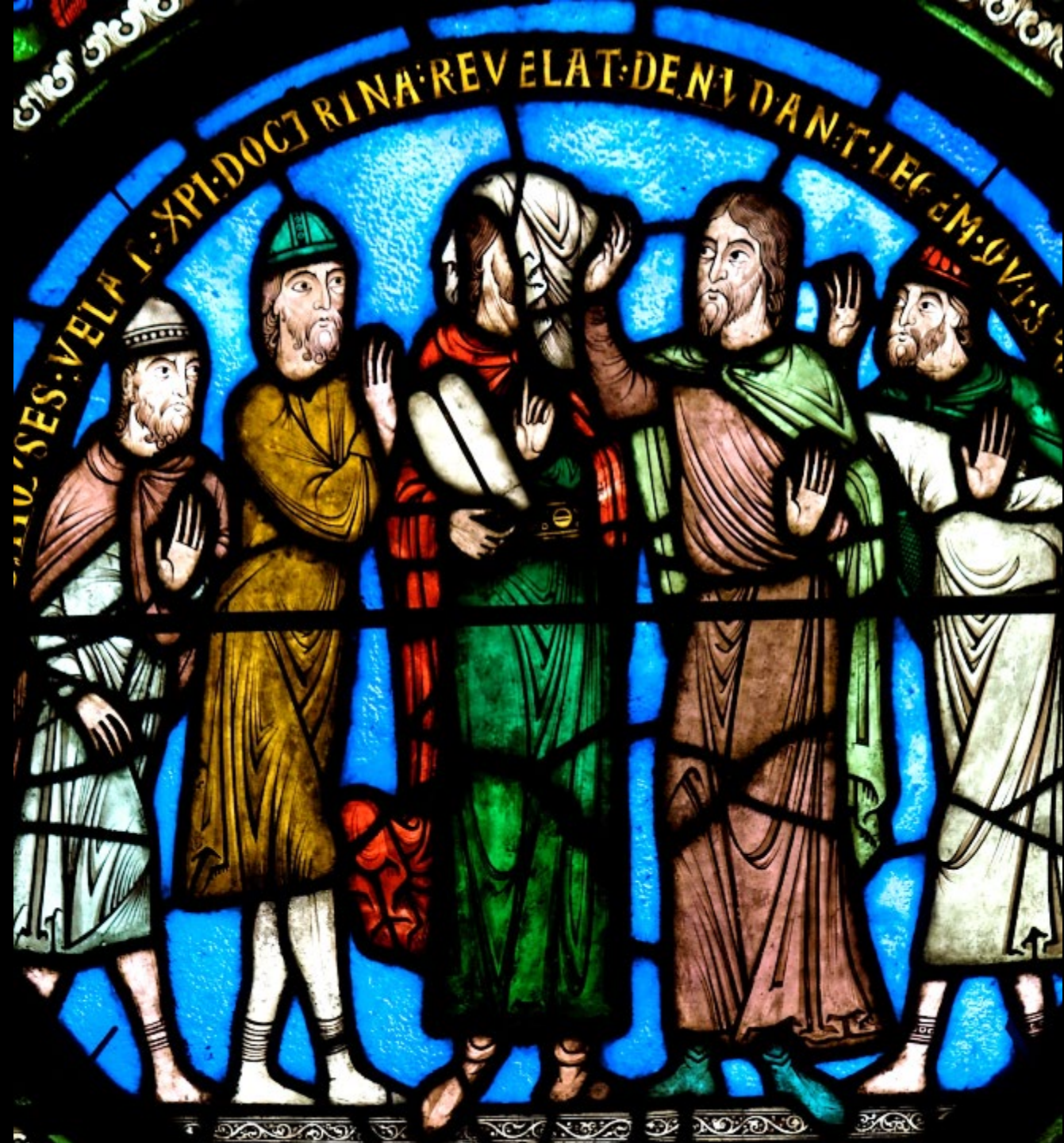
Moses with the Law and the Veil