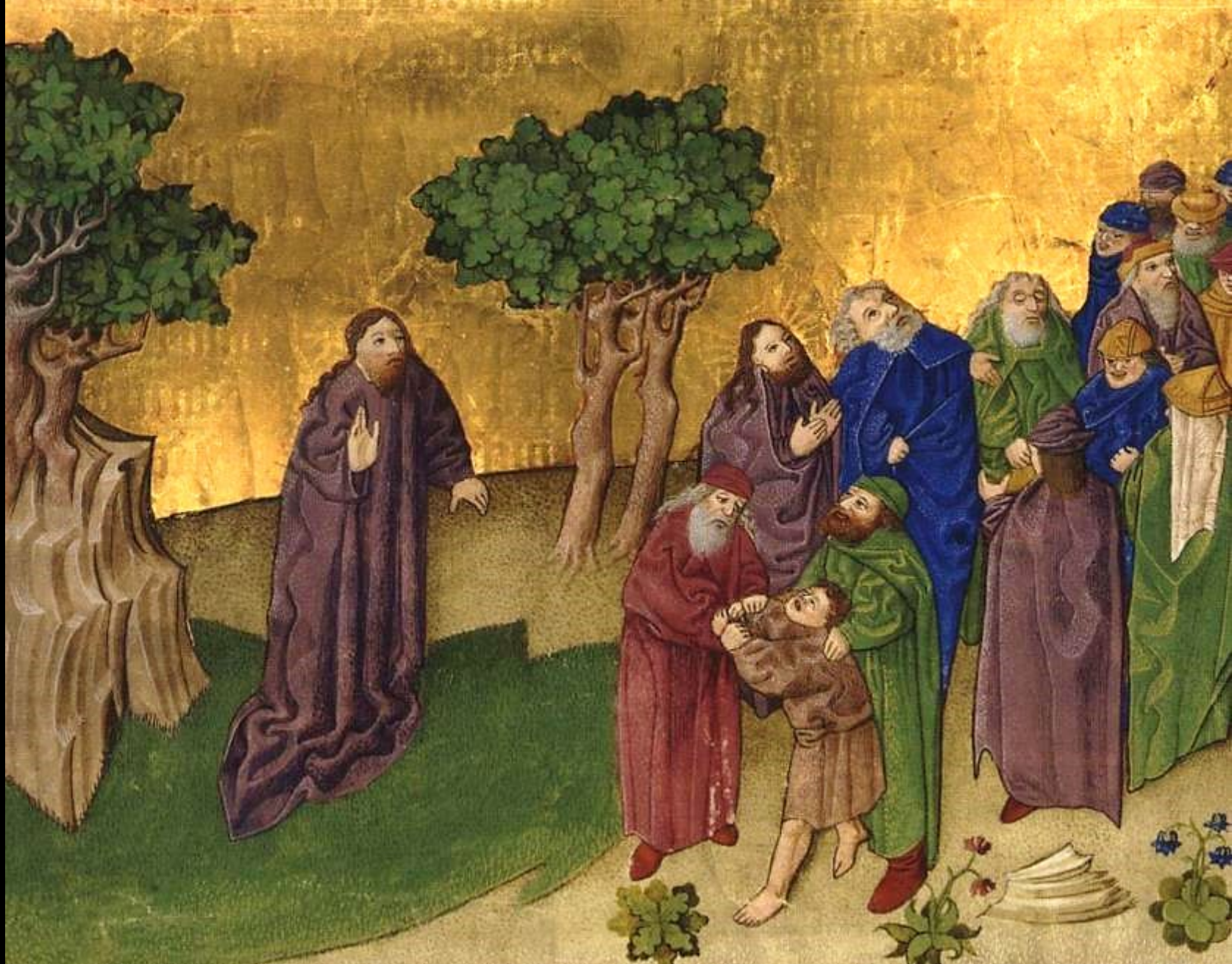
The Healing of the Demon-possessed Boy -- Ottheinrich Bible, Bavarian State Library, Munich, Germany