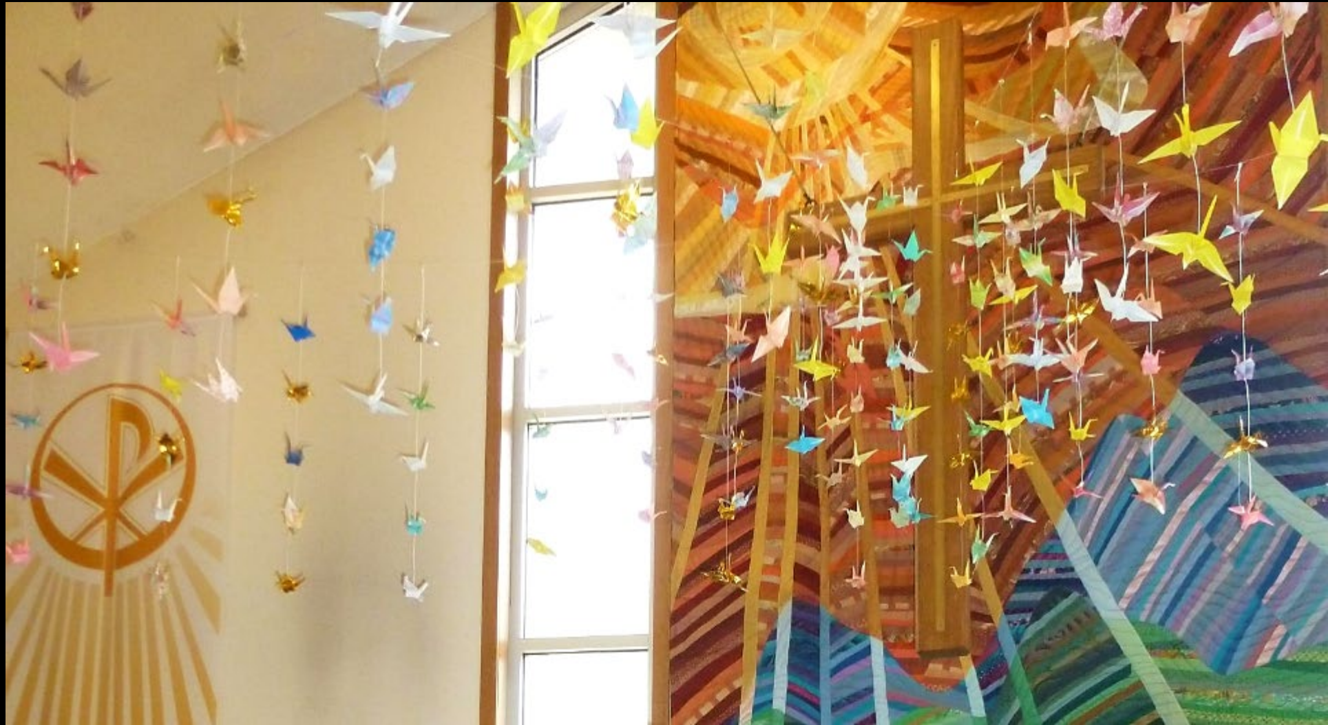
1200 Cranes, Korean Tradition -- King of Kings Lutheran Church, Ann Arbor, MI