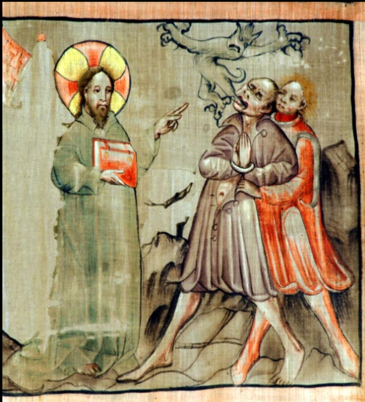
Jesus Casts Out the Unclean Spirit