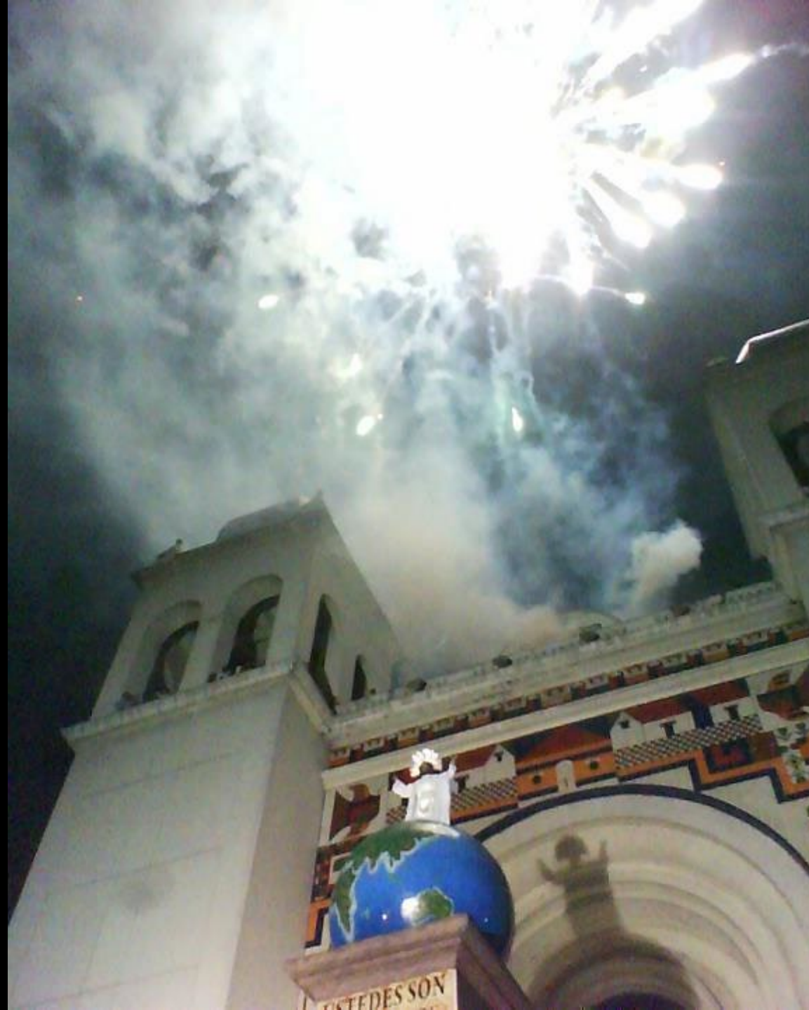
Transfiguration Metropolitan Cathedral San Salvador, El Salvador