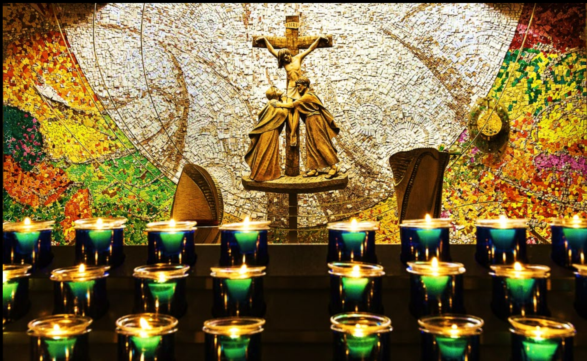
Mosaic in Chapel of Reconciliation -- Knock, County Mayo, Ireland