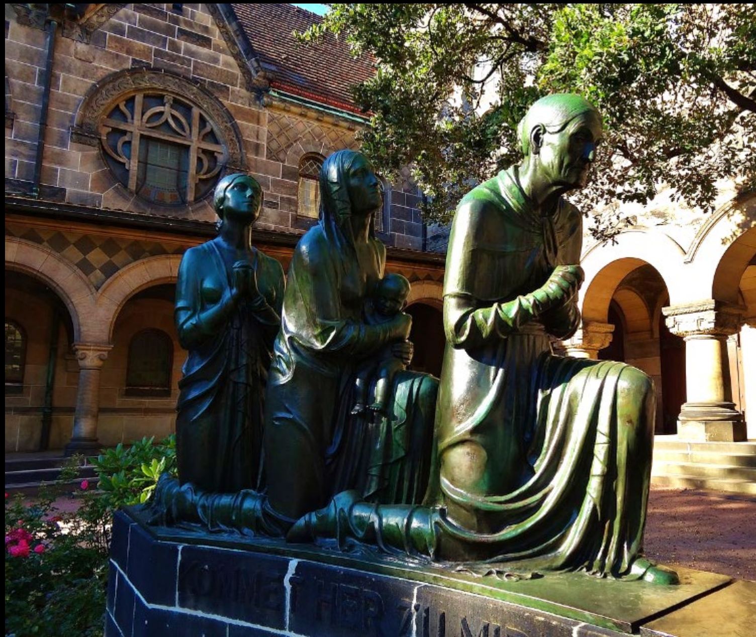
Prayers for Reconciliation (after WWII Bombings) -- Reconciliation Church, Dresden, Germany