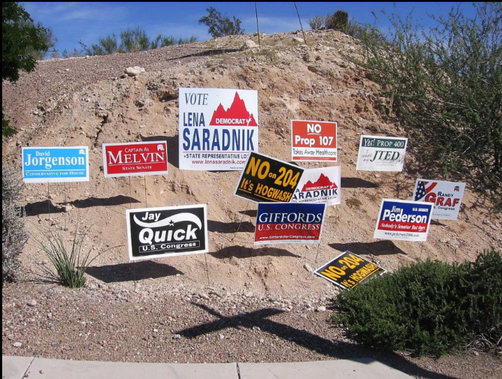
Arizona 8th district campaign signs, 2008