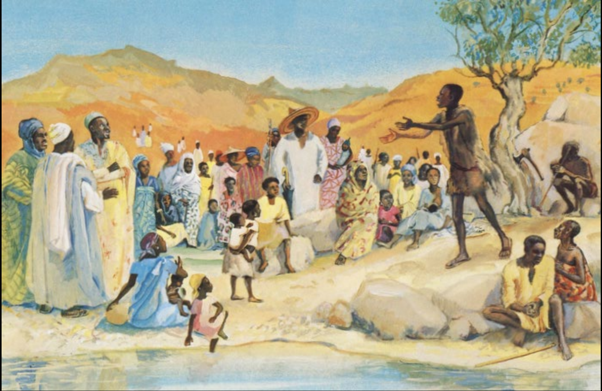
John the Baptist Preaching -- JESUS MAFA, Cameroon