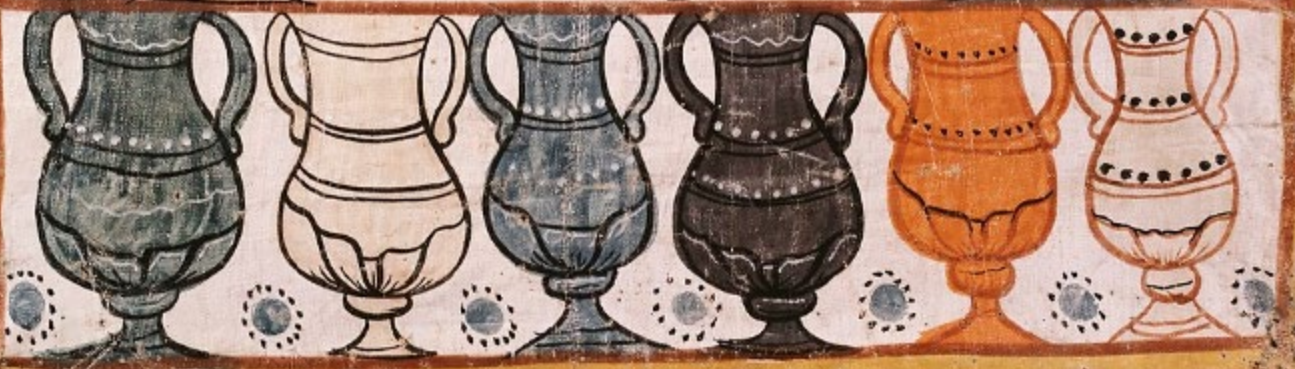
The Marriage in Cana