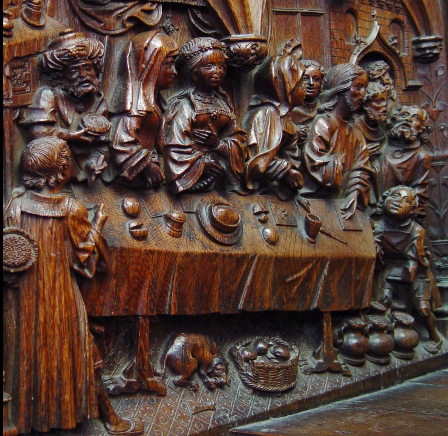
The Marriage Feast at Cana

Choirstall woodcarving Amiens Cathedral Amiens, France