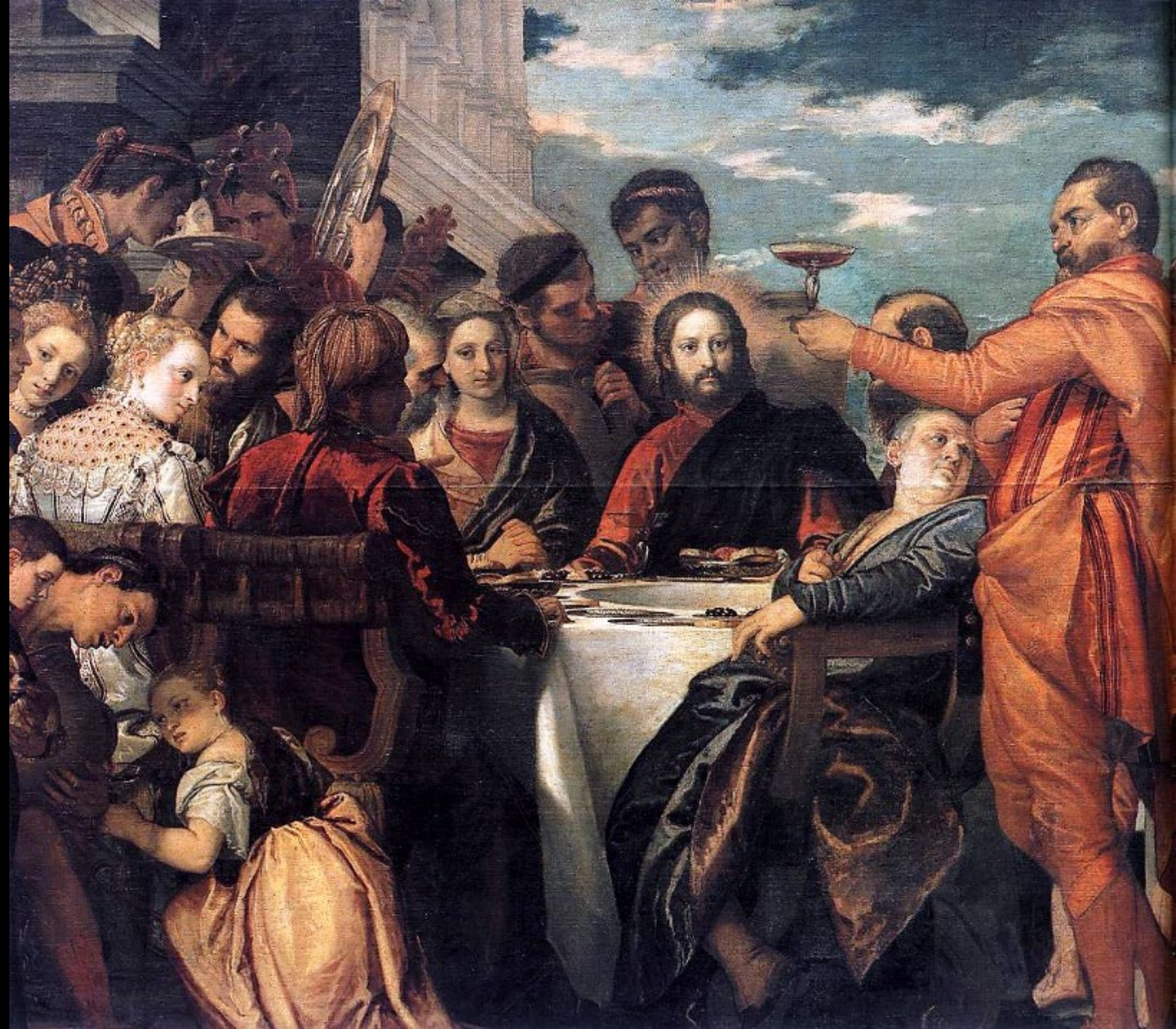
The Wedding at Cana (detail)

Paolo Veronese Gemälde-galerie Alte Meister Dresden, Germany