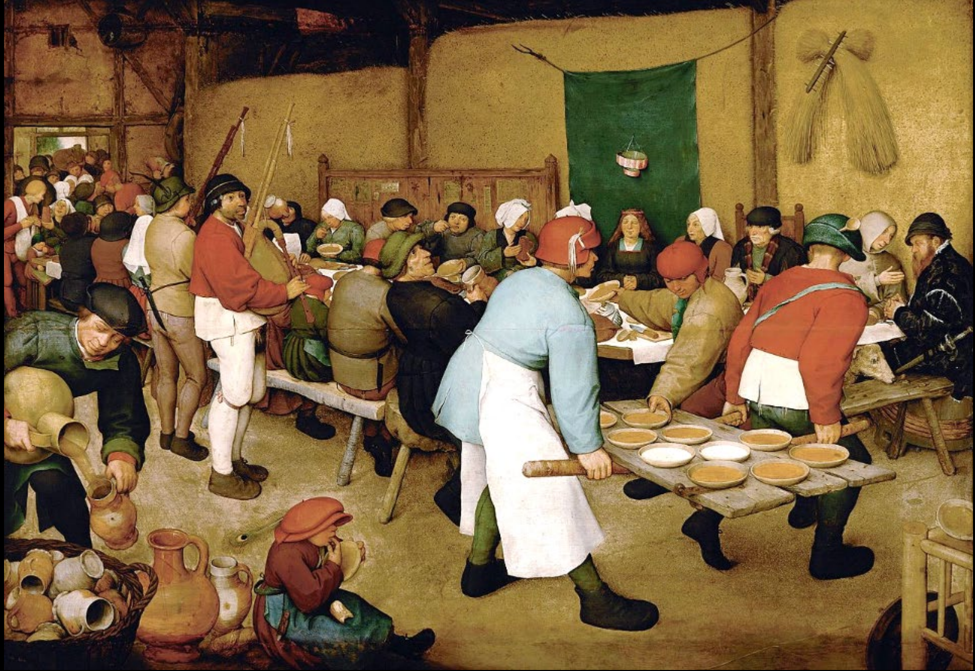
The Peasant Wedding -- Pieter Bruegel the Elder, Kunsthistorisches Museum, Vienna, Austria