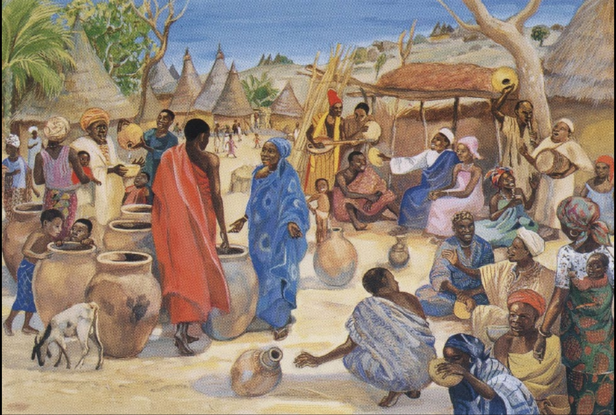
Marriage at Cana -- Duccio, Museo dell'Opera del Duomo, Siena, Italy