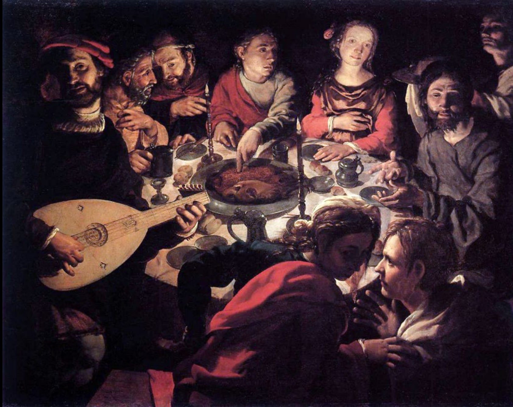
Calling of John During the Marriage at Cana -- Jan Vermeyen, Bonnefanten Museum, Maastricht, NL