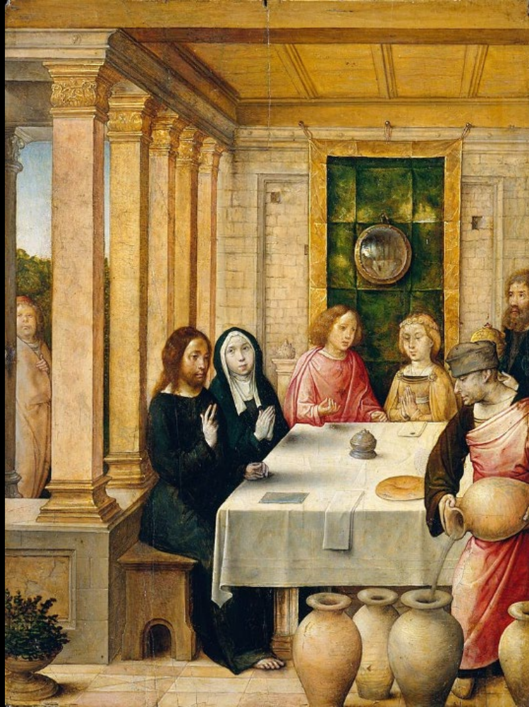
The Marriage Feast at Cana Juan de Flandes Metropolitan Museum of Art New York, NY