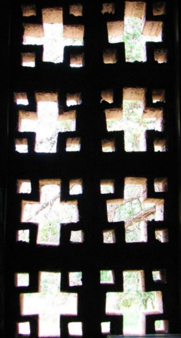
Church Window Church of Mwenzo Mission Nakonde, Zambia