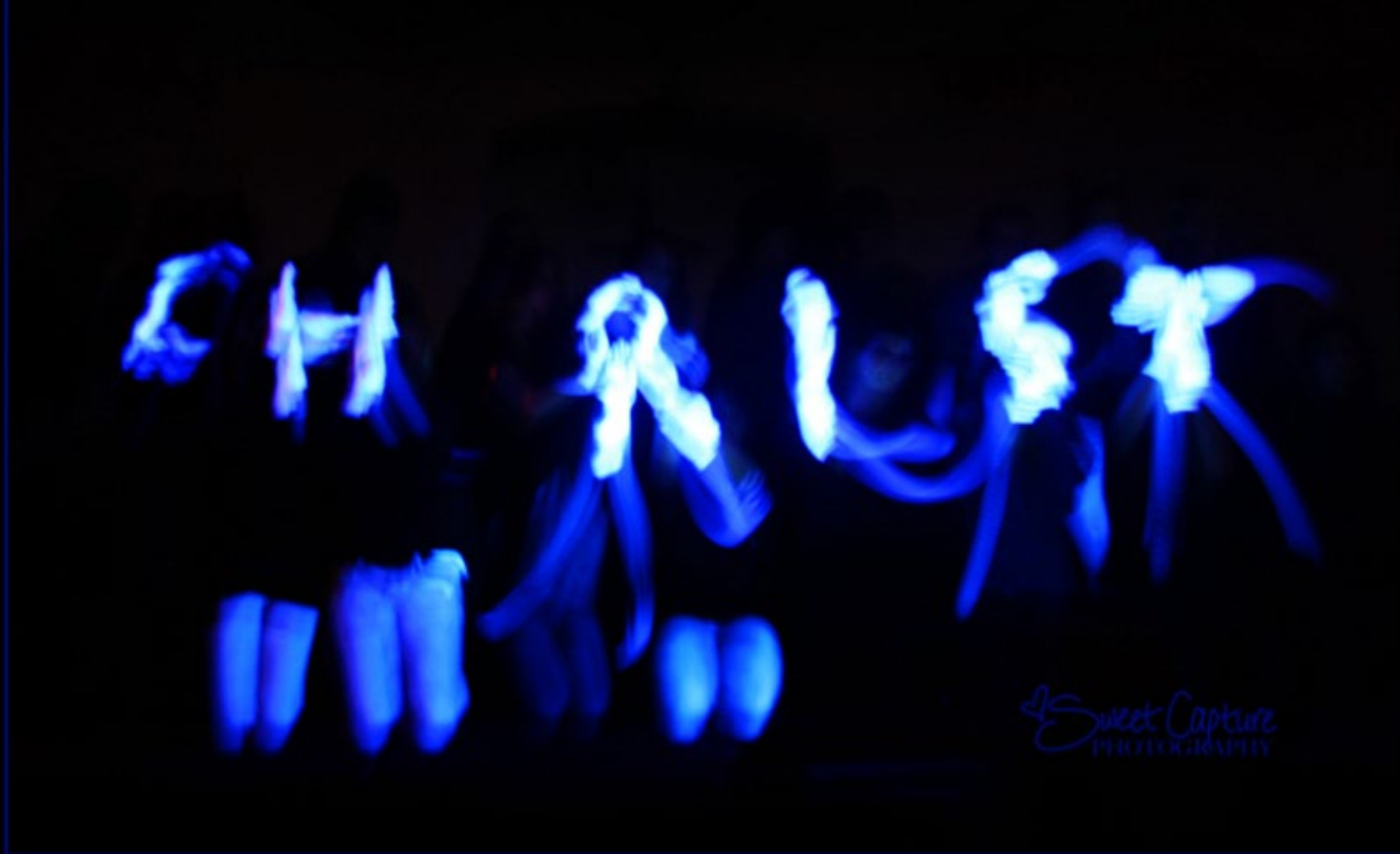
Light of the World -- Presentation by youth with gloves in dark space