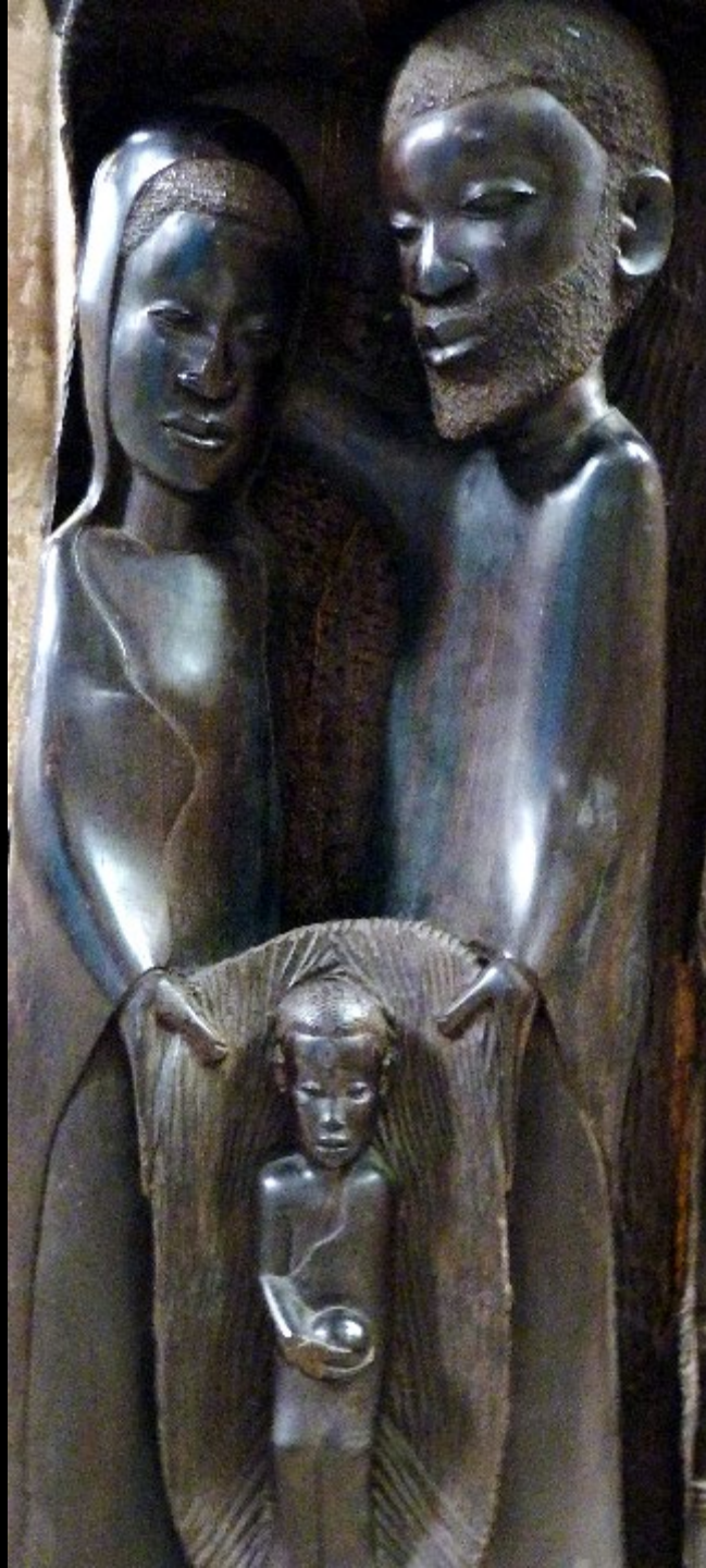
African Nativity St. Sebaldus Nuremburg, Germany