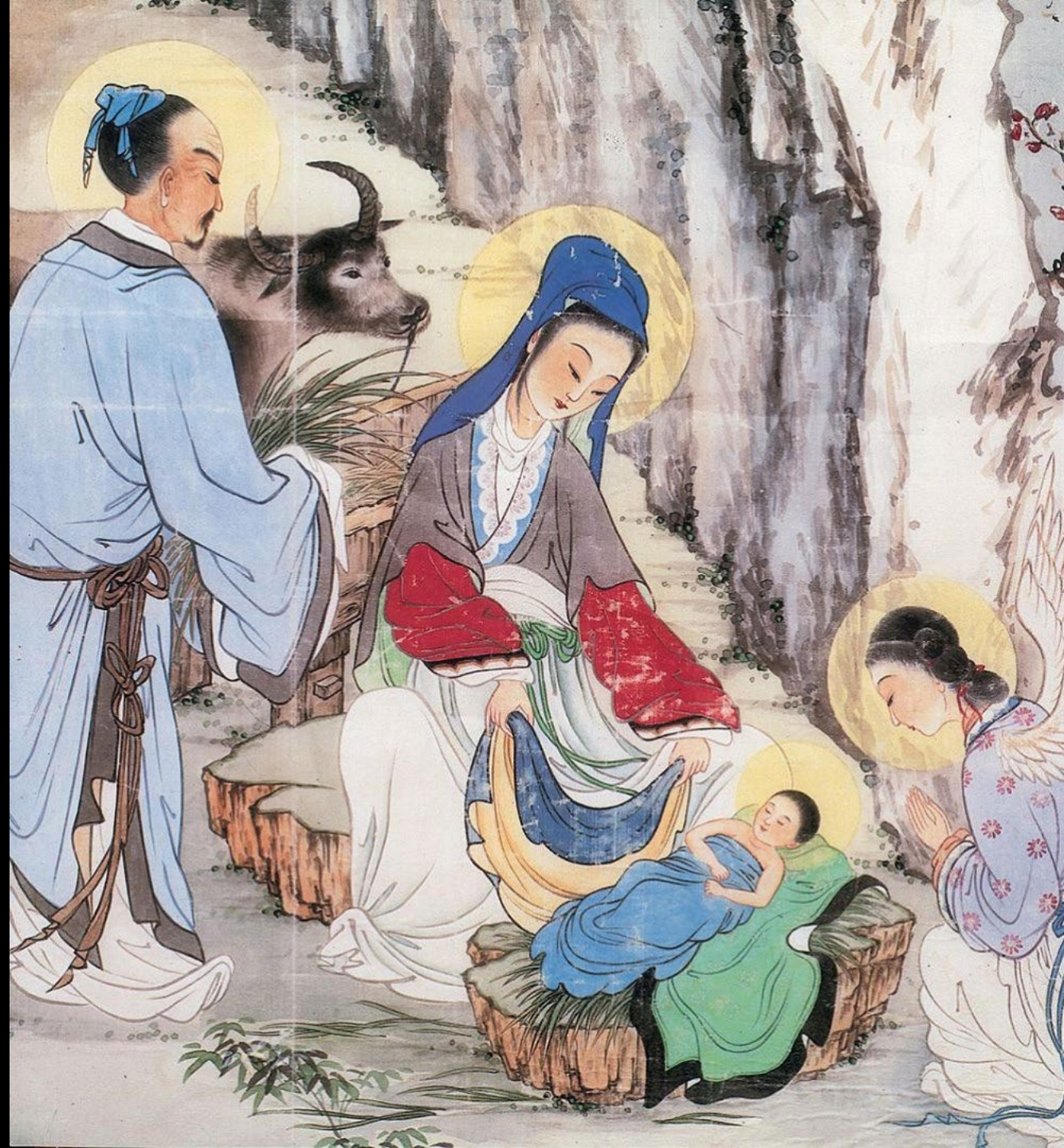
Birth of Christ