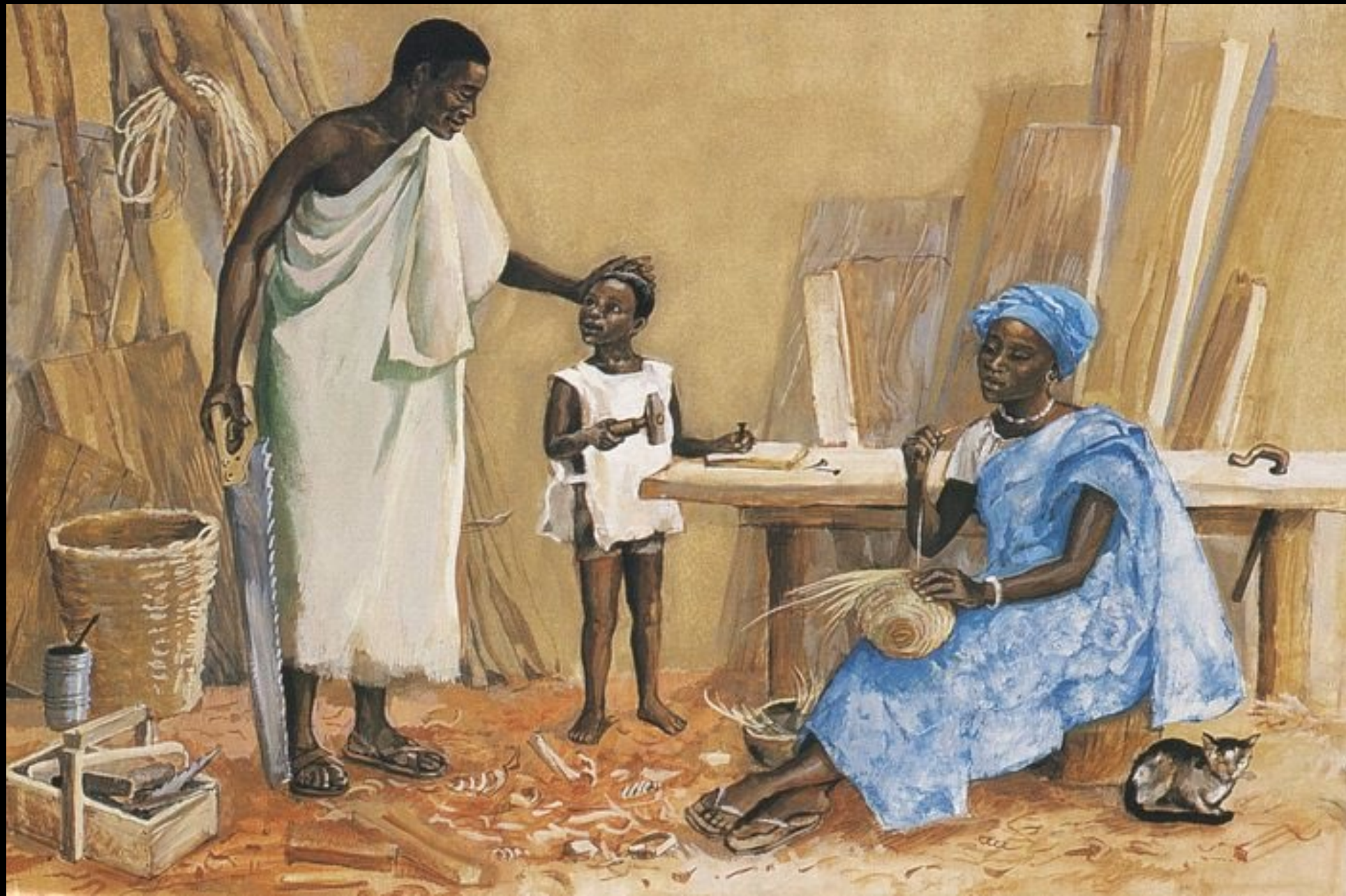
Jesus as a Child -- JESUS MAFA, Cameroon