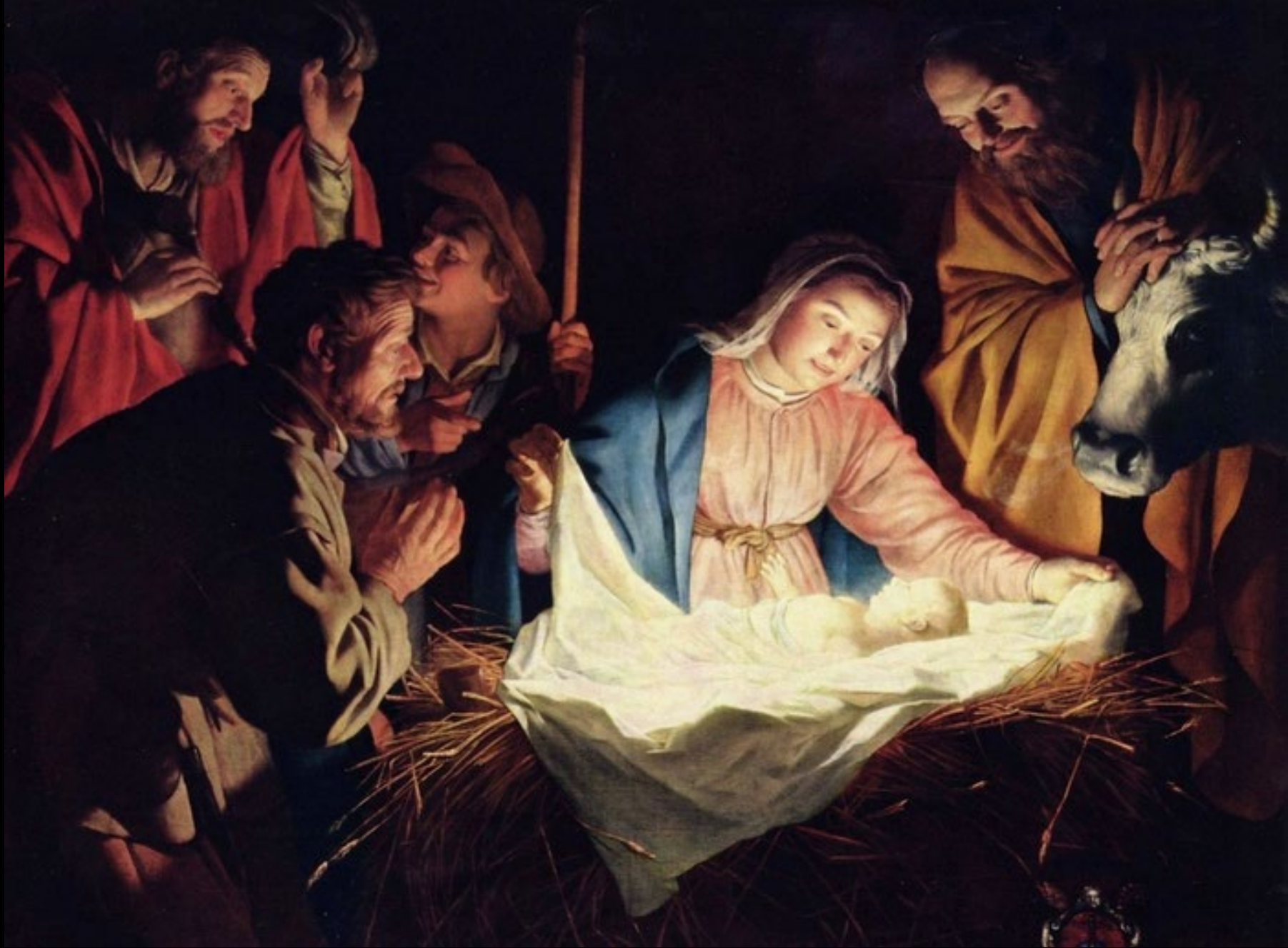
Adoration of the Shepherds -- Gerrit van Honthorst, Wallraf-Richartz Museum, Cologne, GDR