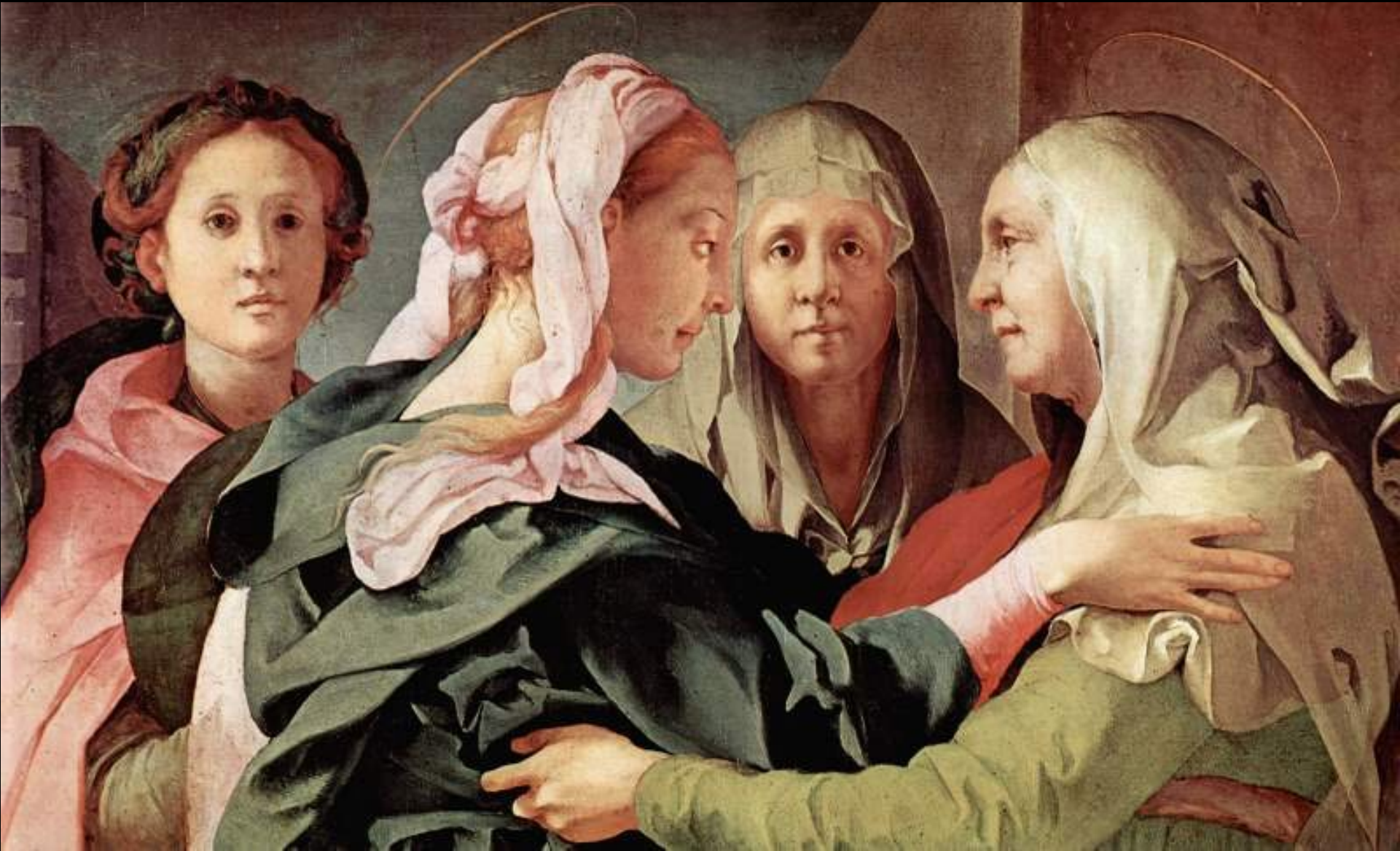
The Visitation -- Jacopo da Pontormo, Pfaarkirche, Carmignano, Italy