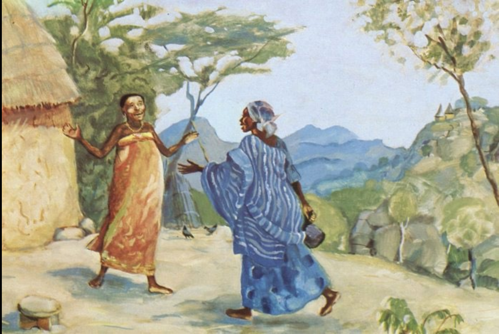
Elizabeth and Mary Greet Each Other -- JESUS MAFA, Cameroon