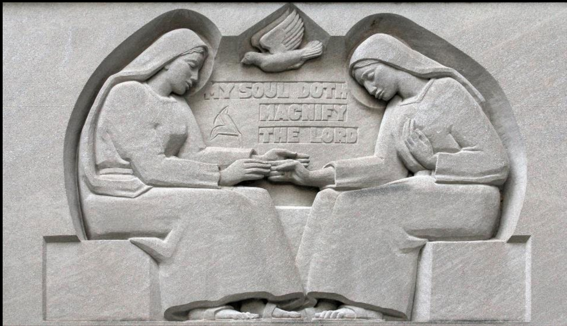
The Magnificat ("My Soul Doth Magnify the Lord") -- Baltimore Cathedral, Baltimore, MD