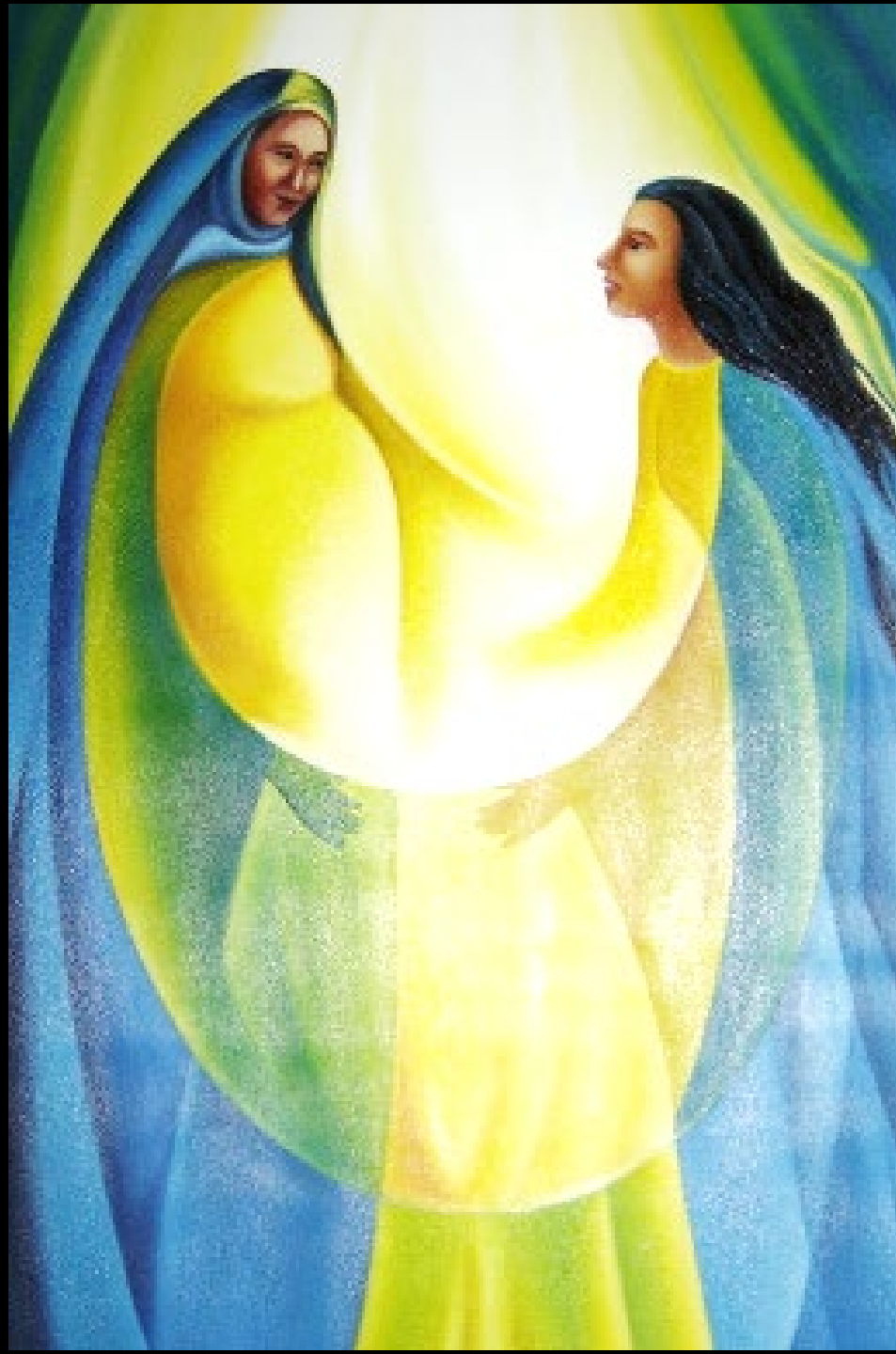
Visitation Church of El Sitio El Sitio, El Salvador