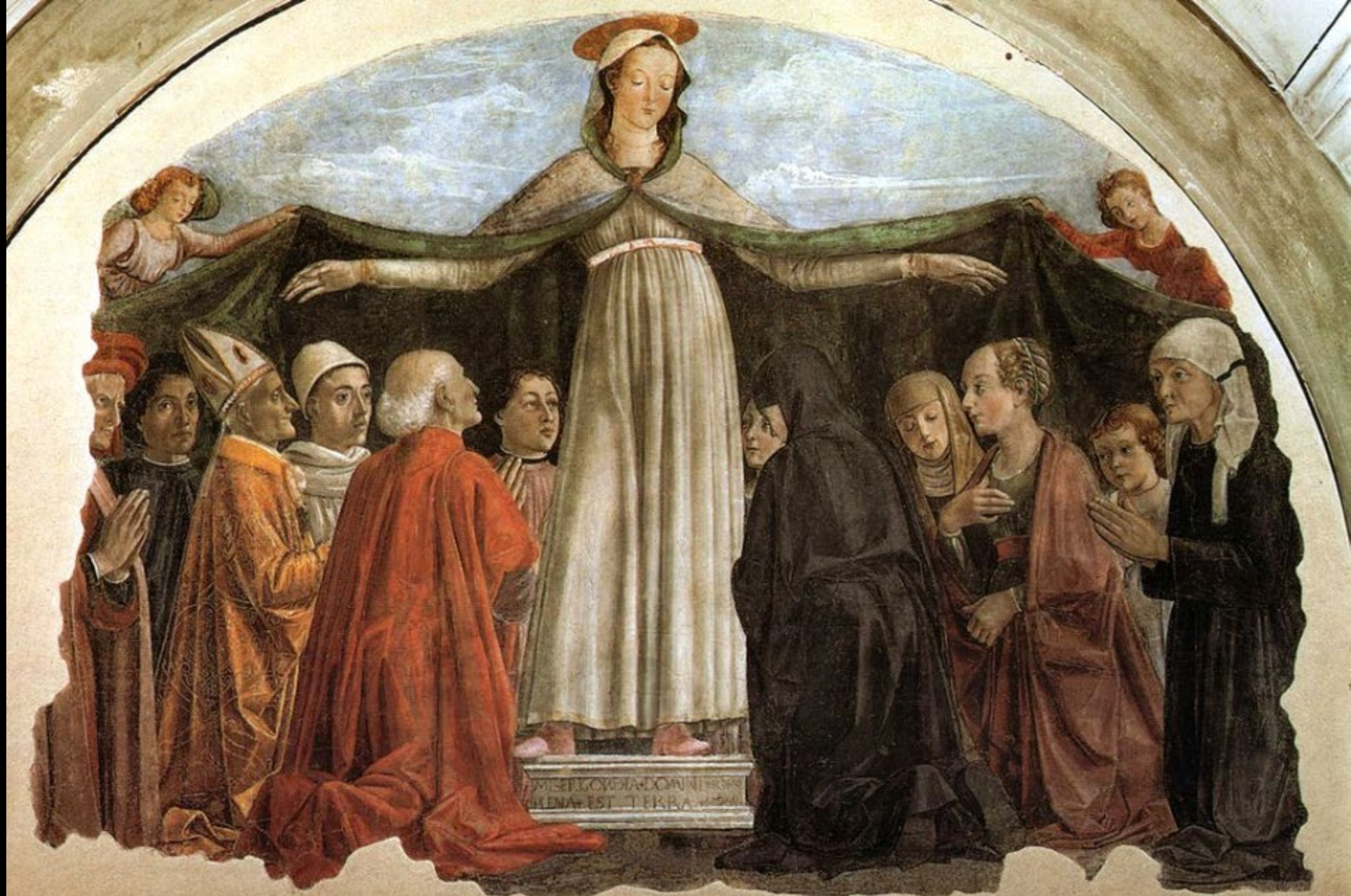
Madonna of Mercy -- Domenico Ghirlandaio, San Salvatore di Ognissanti, Florence, Italy