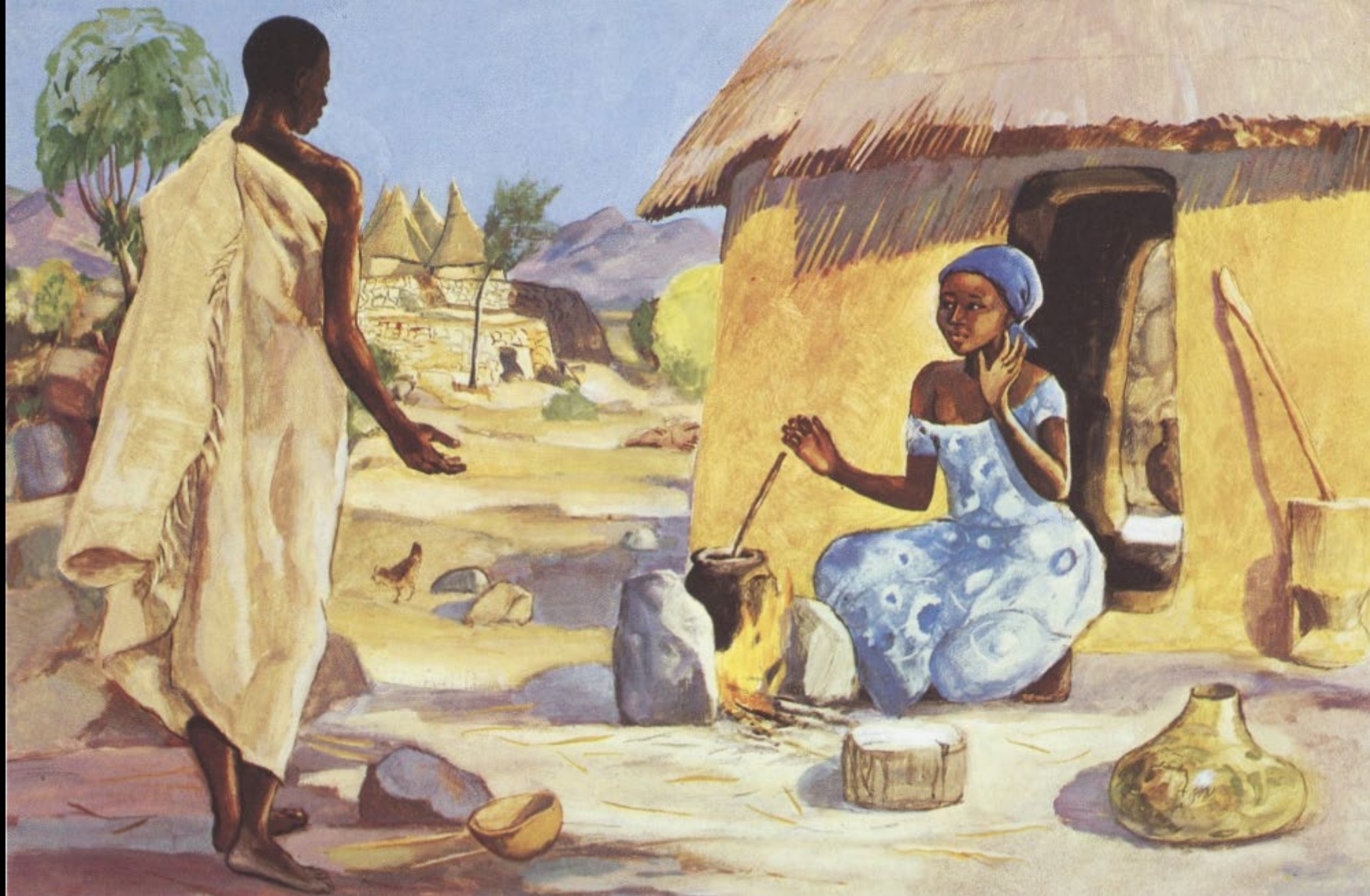
The Annunciation -- JESUS MAFA, Cameroon