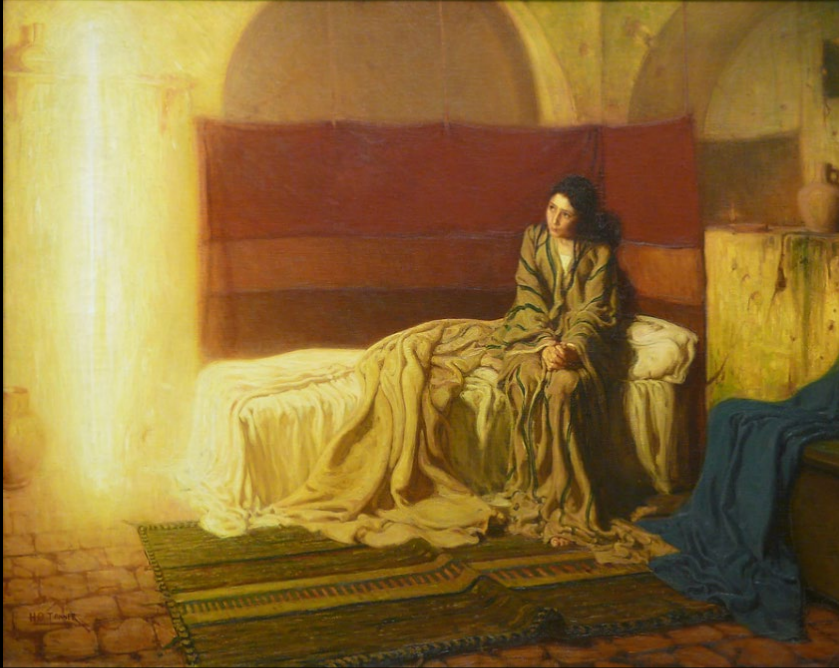
The Annunciation -- Henry Ossawa Tanner, Philadelphia Museum of Art, Philadelphia, PA