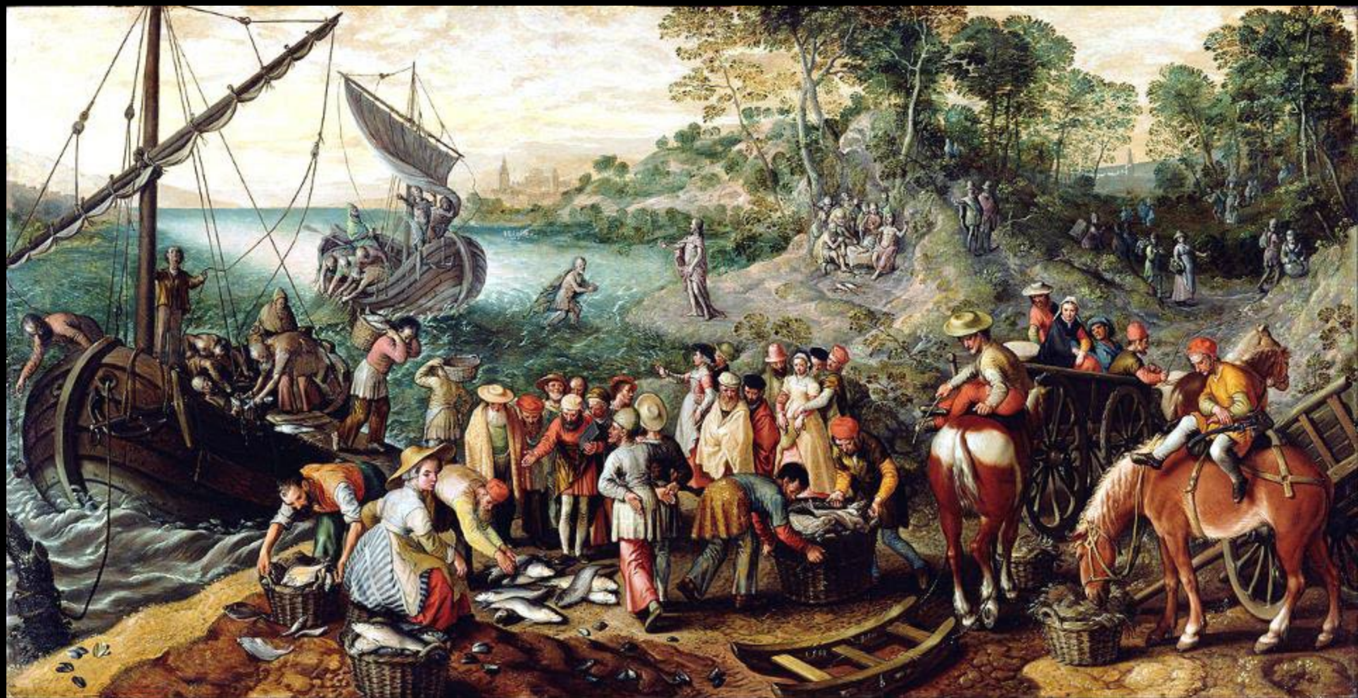
Miraculous Draught of Fishes -- Joachim Beuckelaer, Getty Center, Los Angeles, CA