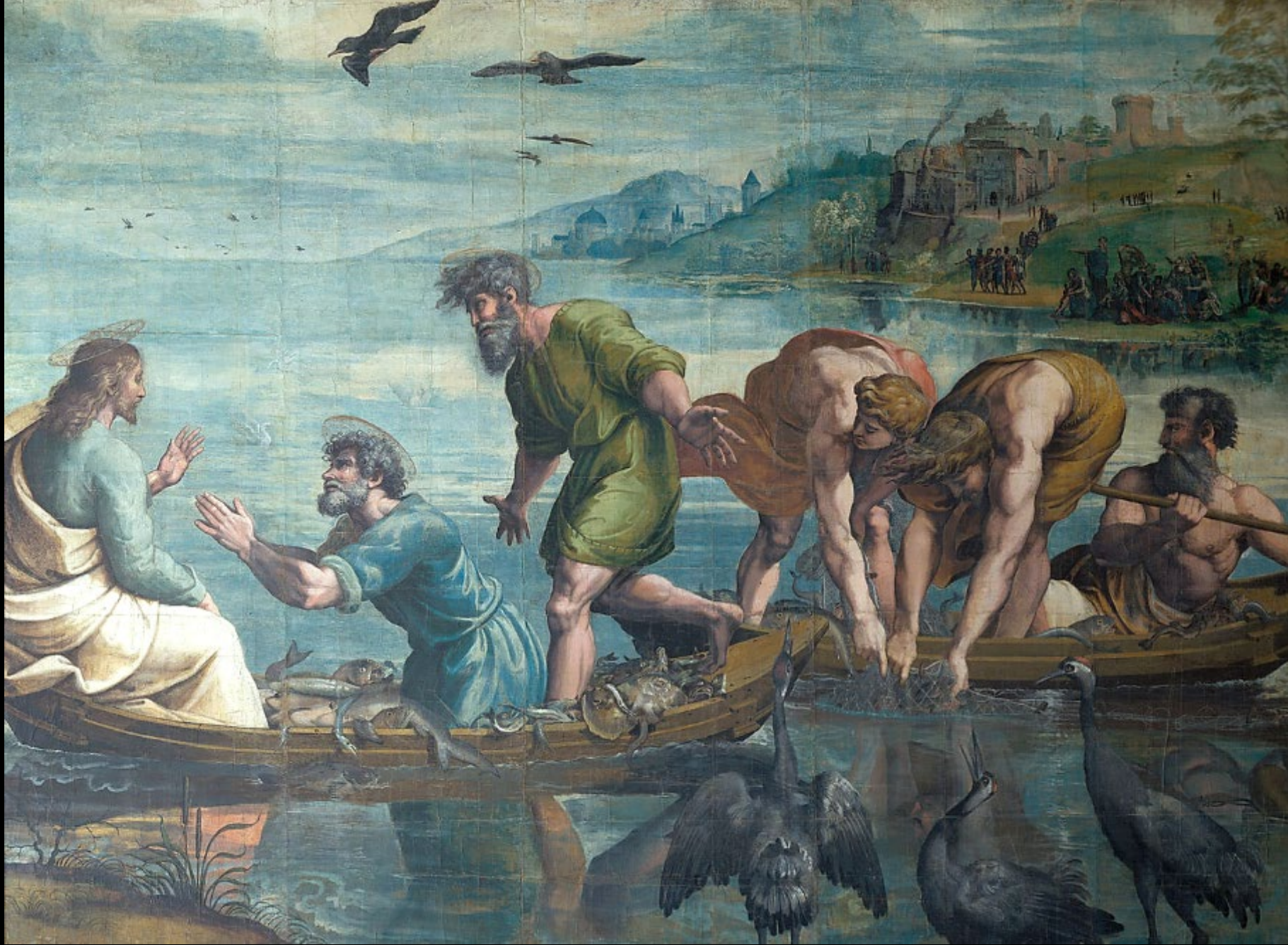
The Miraculous Draught of Fishes -- Raphael, Victoria and Albert Museum, London, England