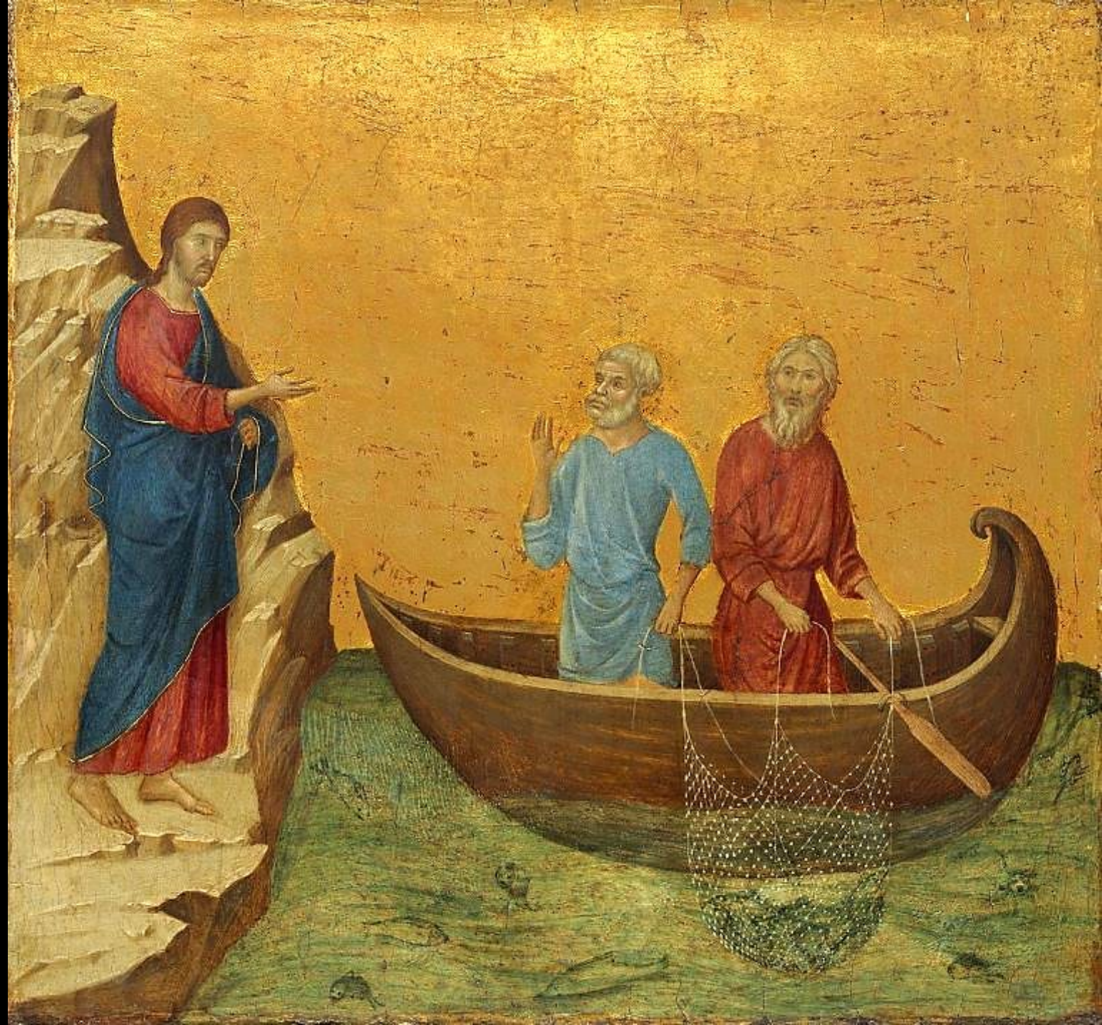
Christ Calls Simon Peter and Andrew

Duccio, National Gallery of Art, Washington, DC