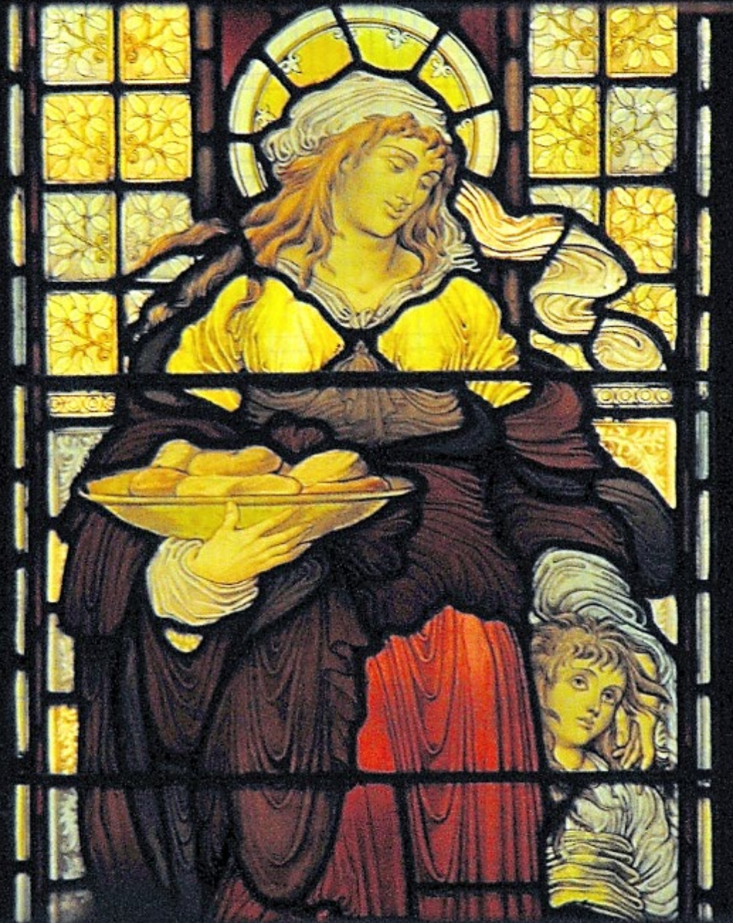
Dorcas Window Llandaff Cathedral Cardiff, Wales