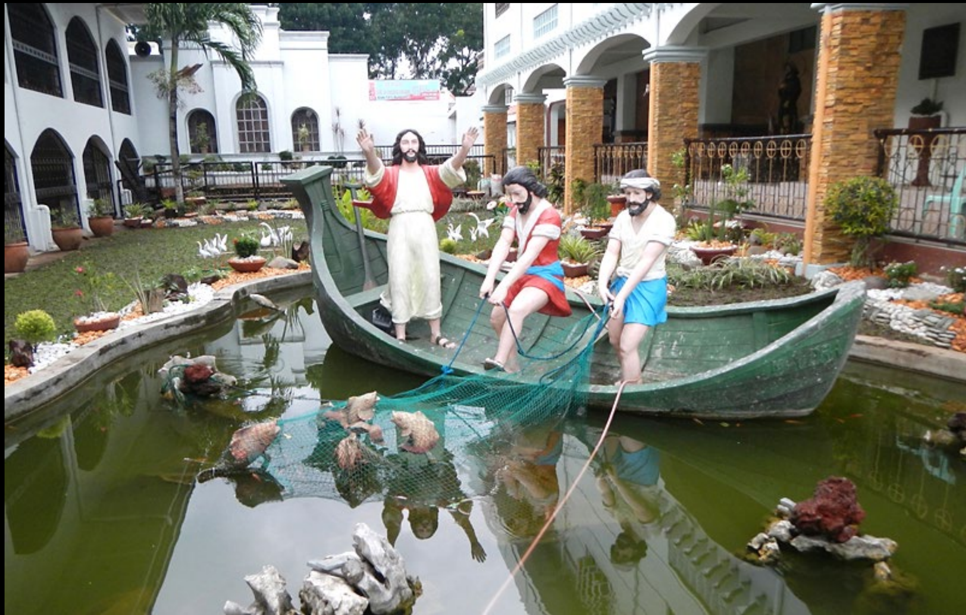
Christ and Simon Peter and Andrew -- San Pedro Bautista, Candelaria, Philippines