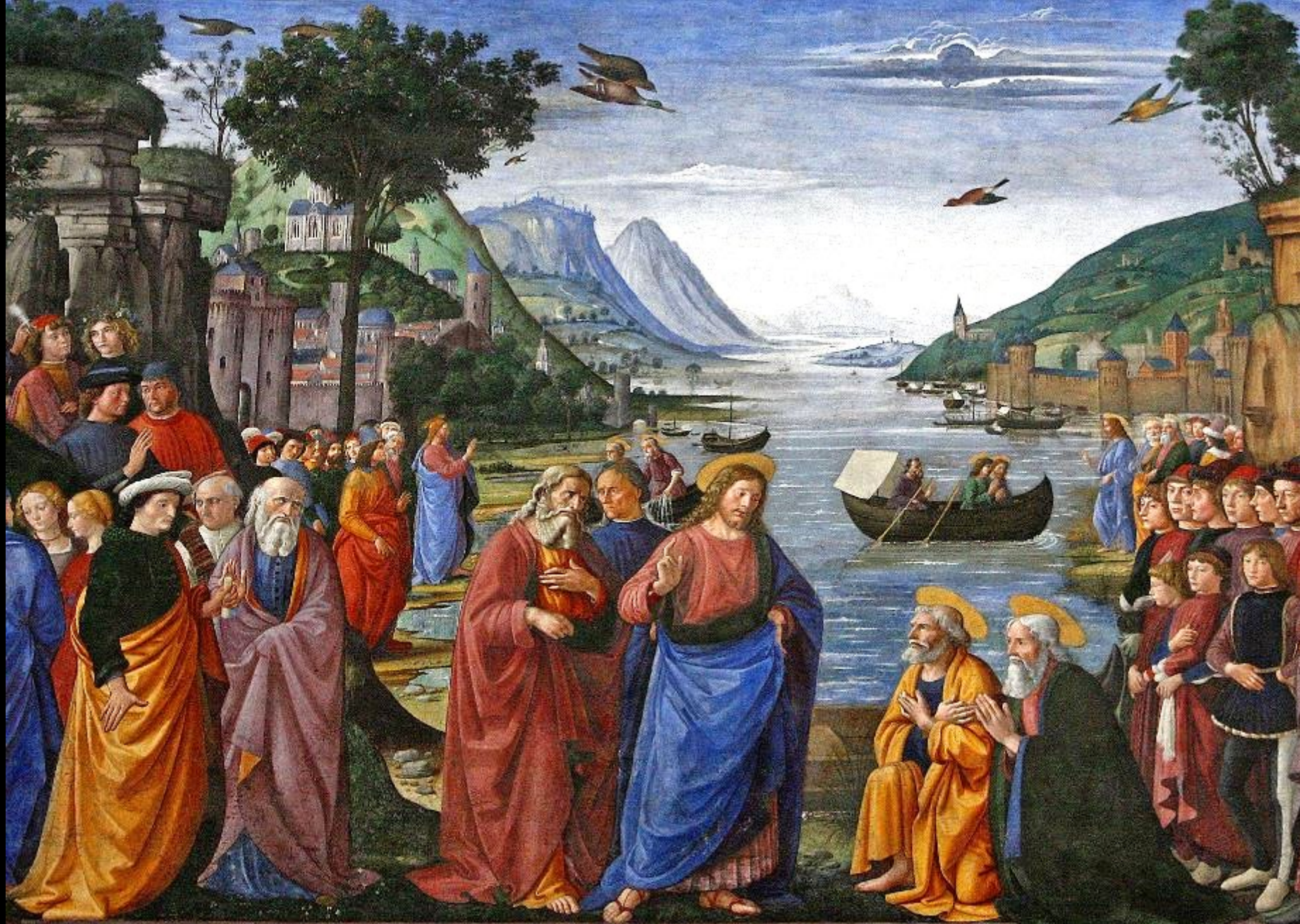
Calling of the Disciples -- Domenico Ghirlandaio, Sistine Chapel, Vatican, Vatican City, Italy