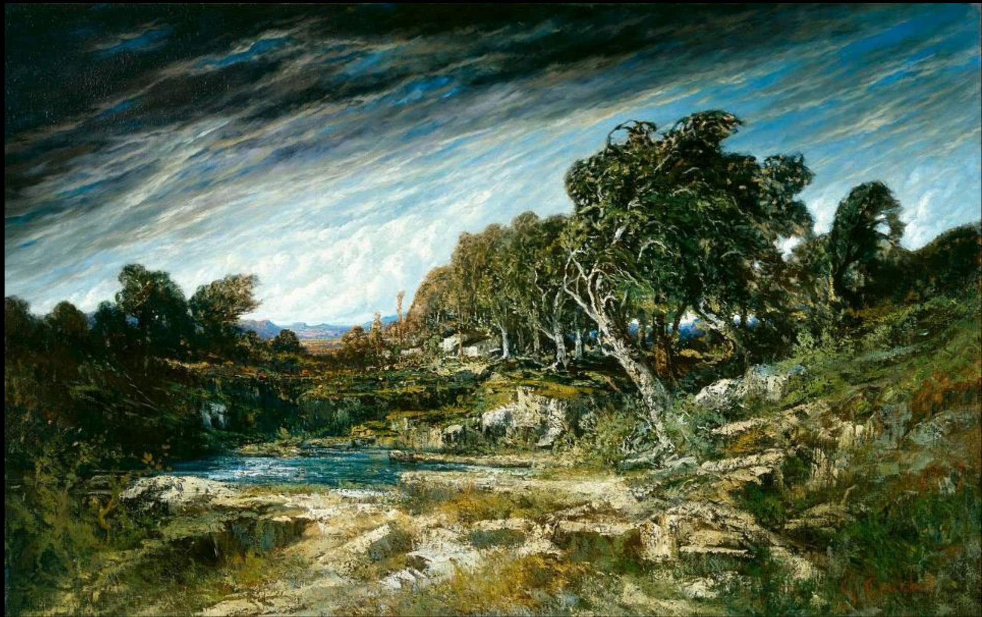
The Gust of Wind -- Gustave Courbet, Museum of Fine Arts, Houston, TX