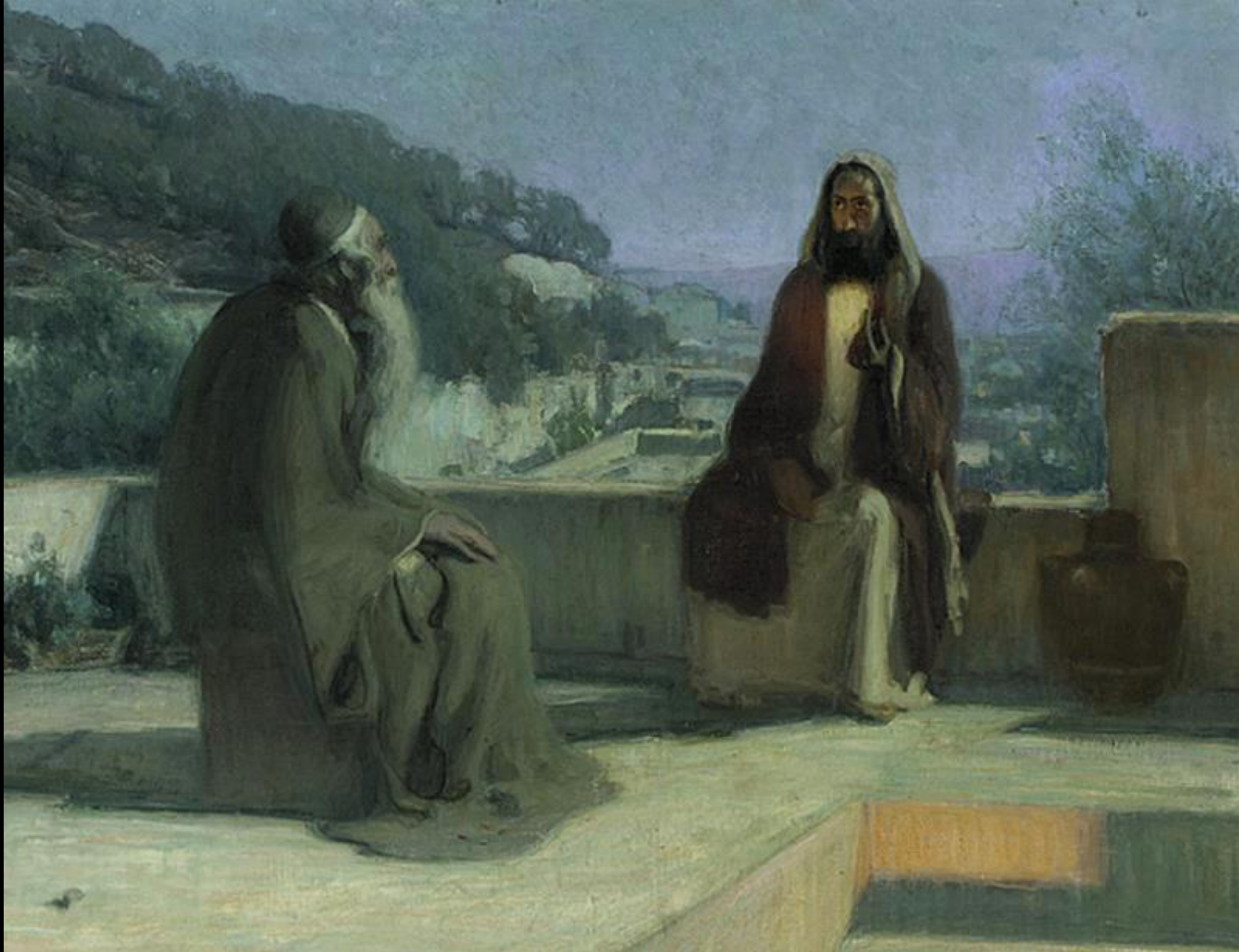
Nicodemus Comes to Jesus at Night -- Henry O. Tanner