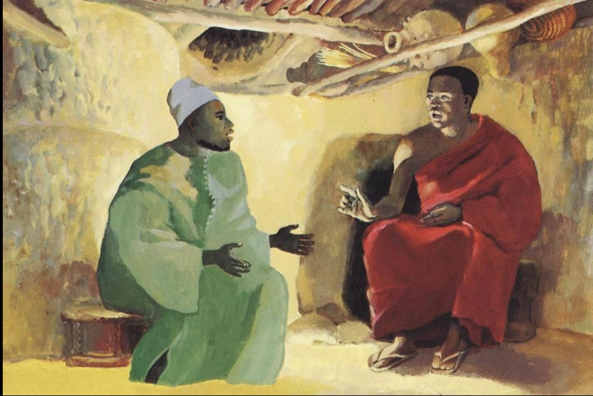
Nicodemus and Jesus -- JESUS MAFA, Cameroon