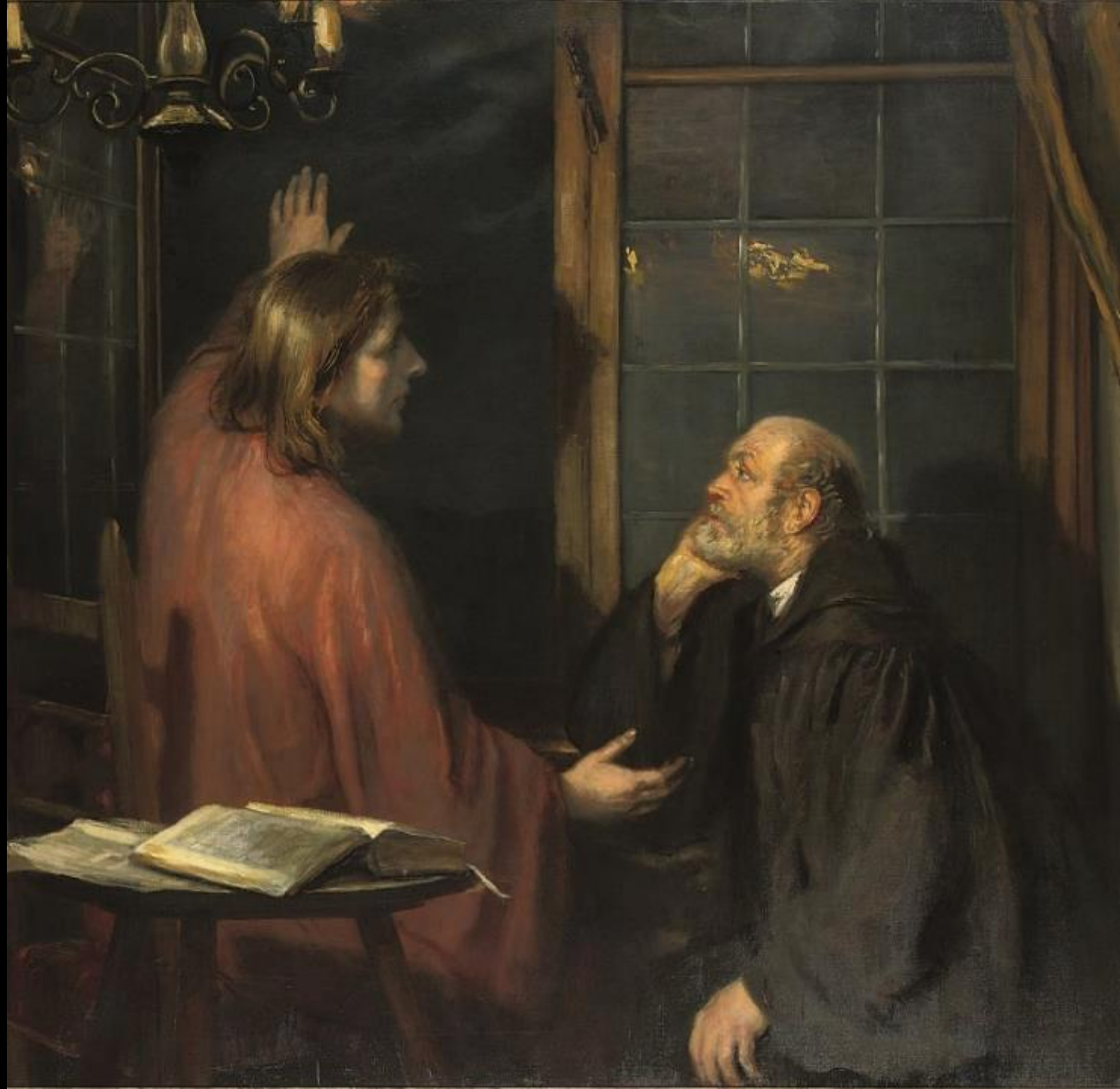
Christ and Nicodemus