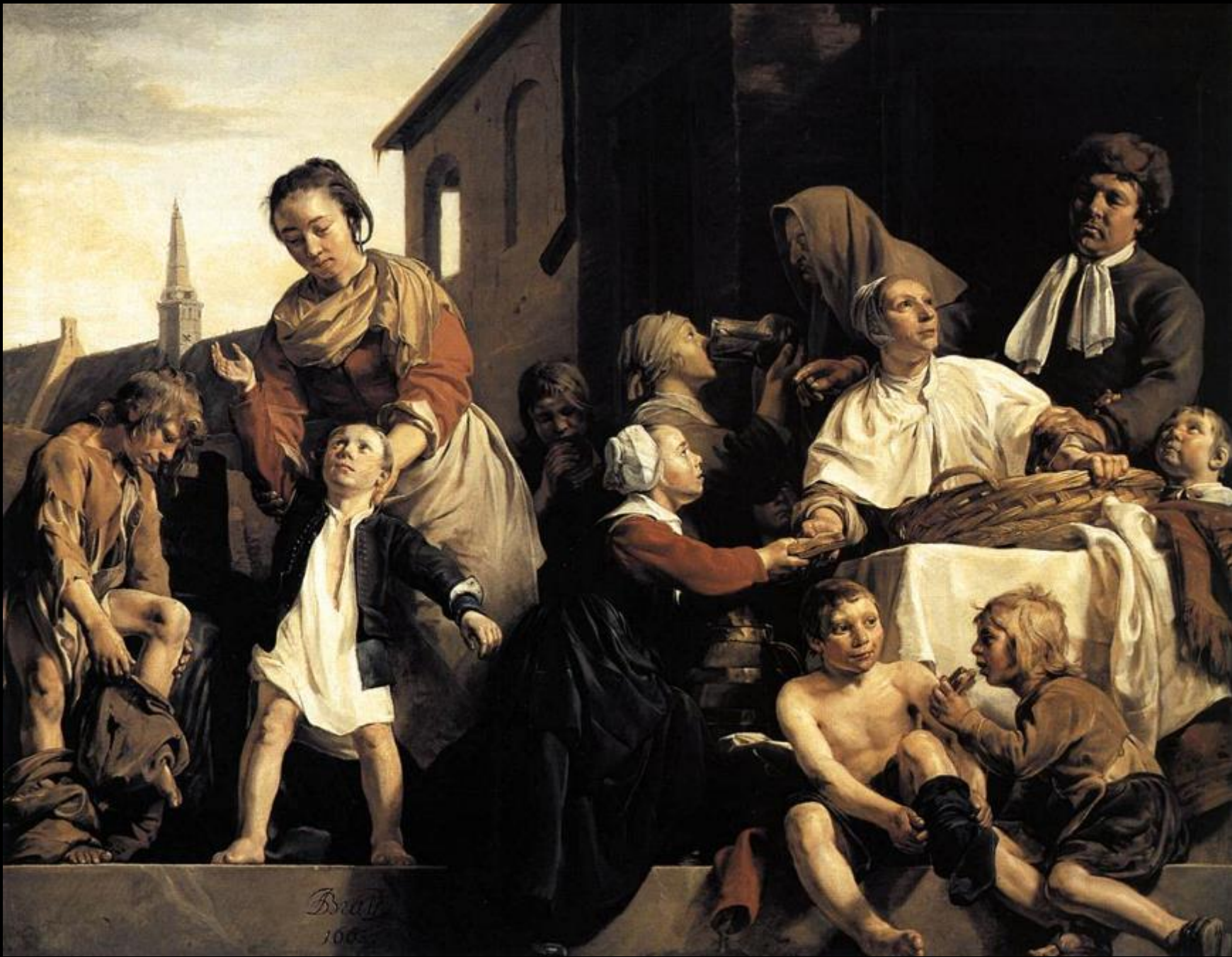
Tending Children at the Orphanage, Jan de Bray, Frans Hal Museum, Haarlem, Netherlands