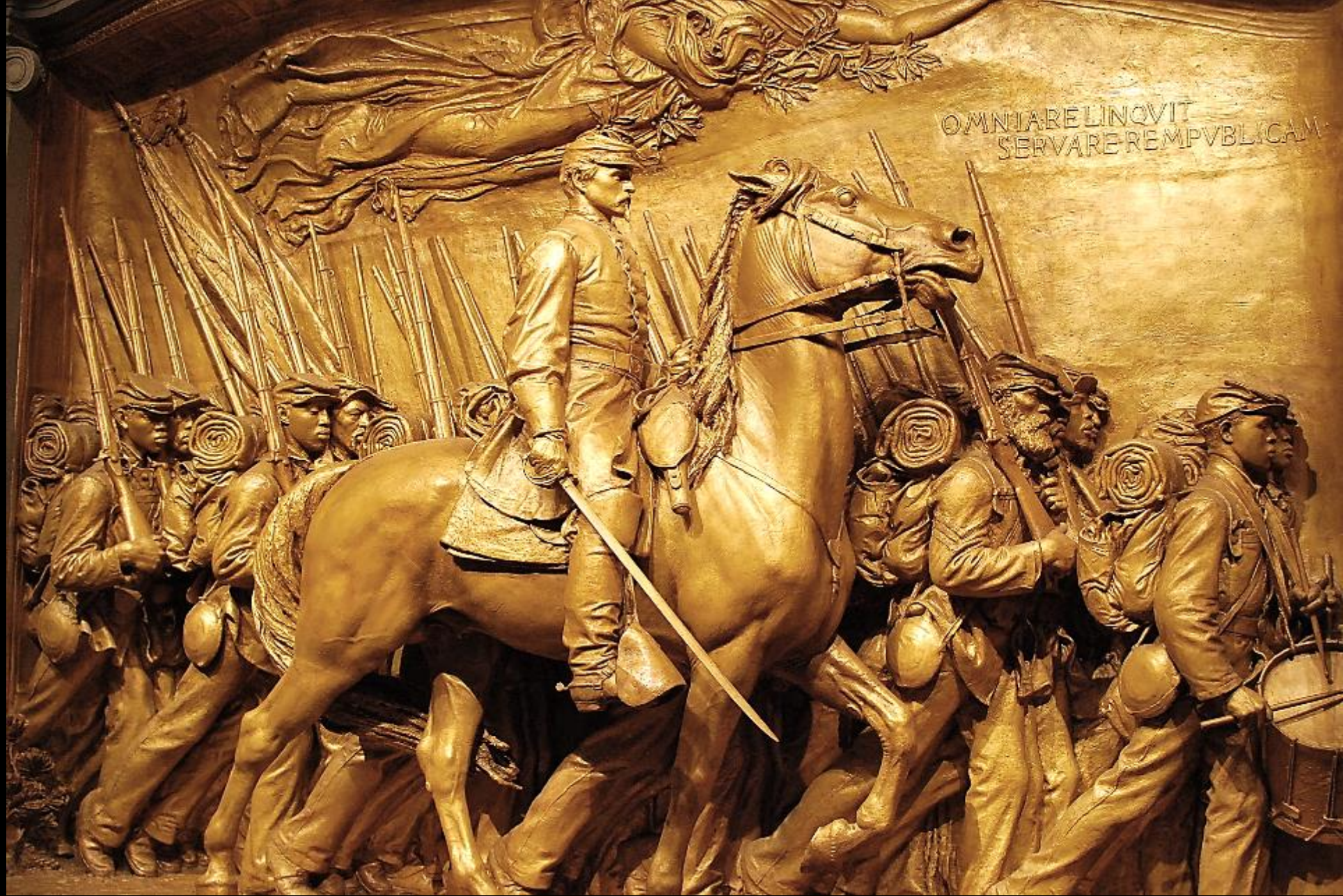
Shaw Civil War Memorial -- Augustus Saint-Gaudens, National Gallery of Art, Washington, DC