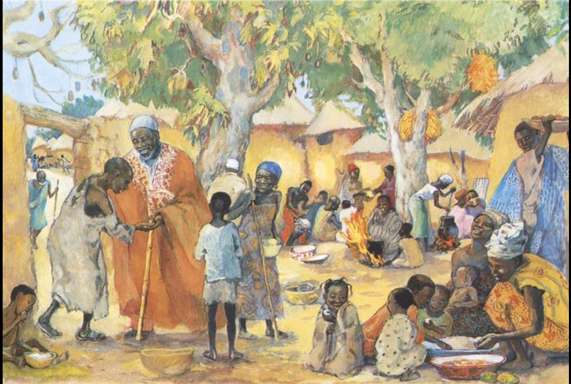
The Poor Invited to the Feast -- JESUS MAFA, Cameroon