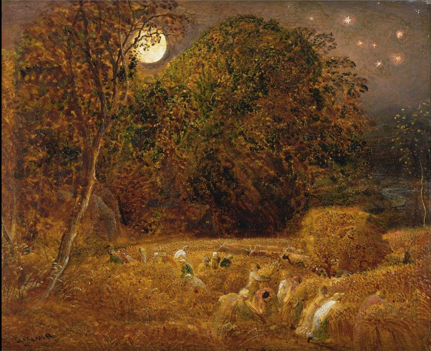
The Harvest Moon -- Samuel Palmer, Yale Center for British Art, New Haven, CT