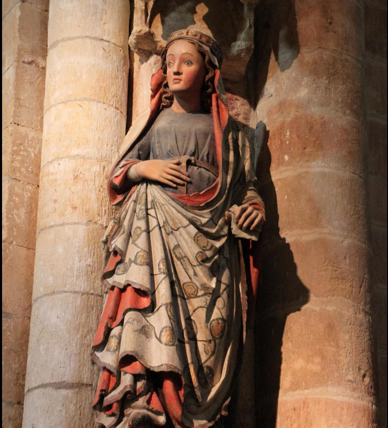
Mary with Child

Collegiate Church Of St Mary Major Toro, Spain