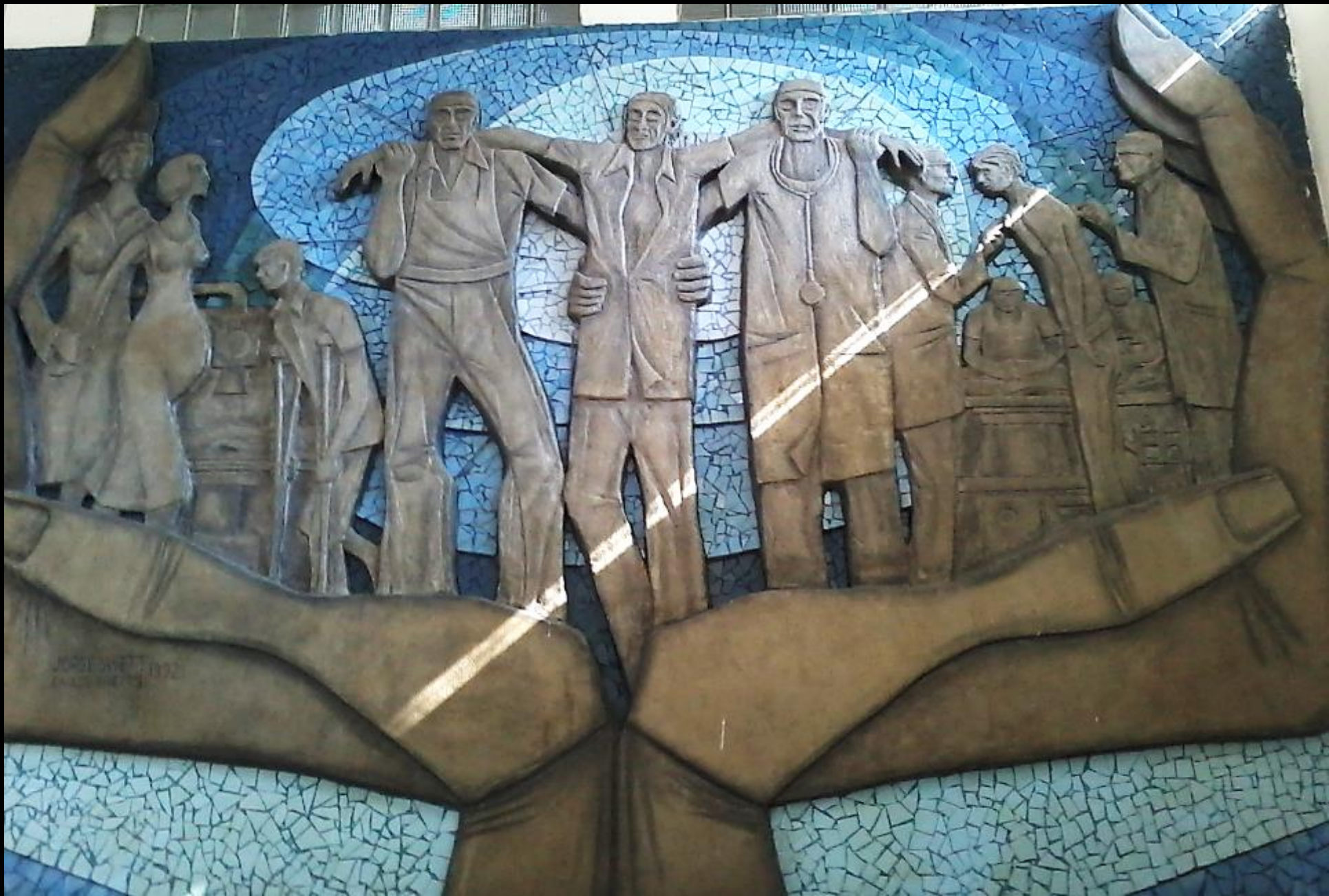
Healing Mural -- Hospital Teodoro Maldonado Carbo, Guayaquil, Ecuador