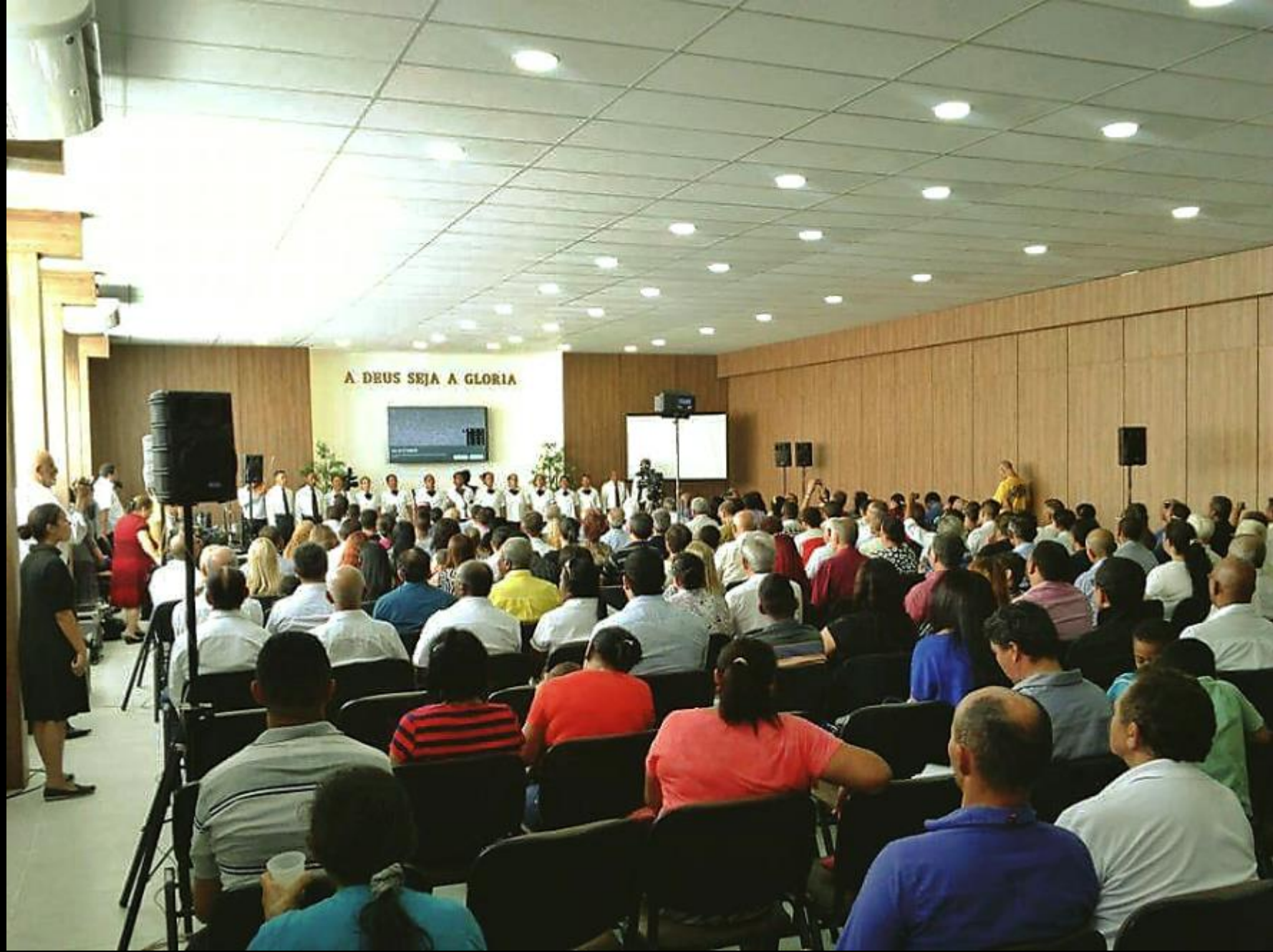
Church of God International Worship service, Sao Paolo, Brazil