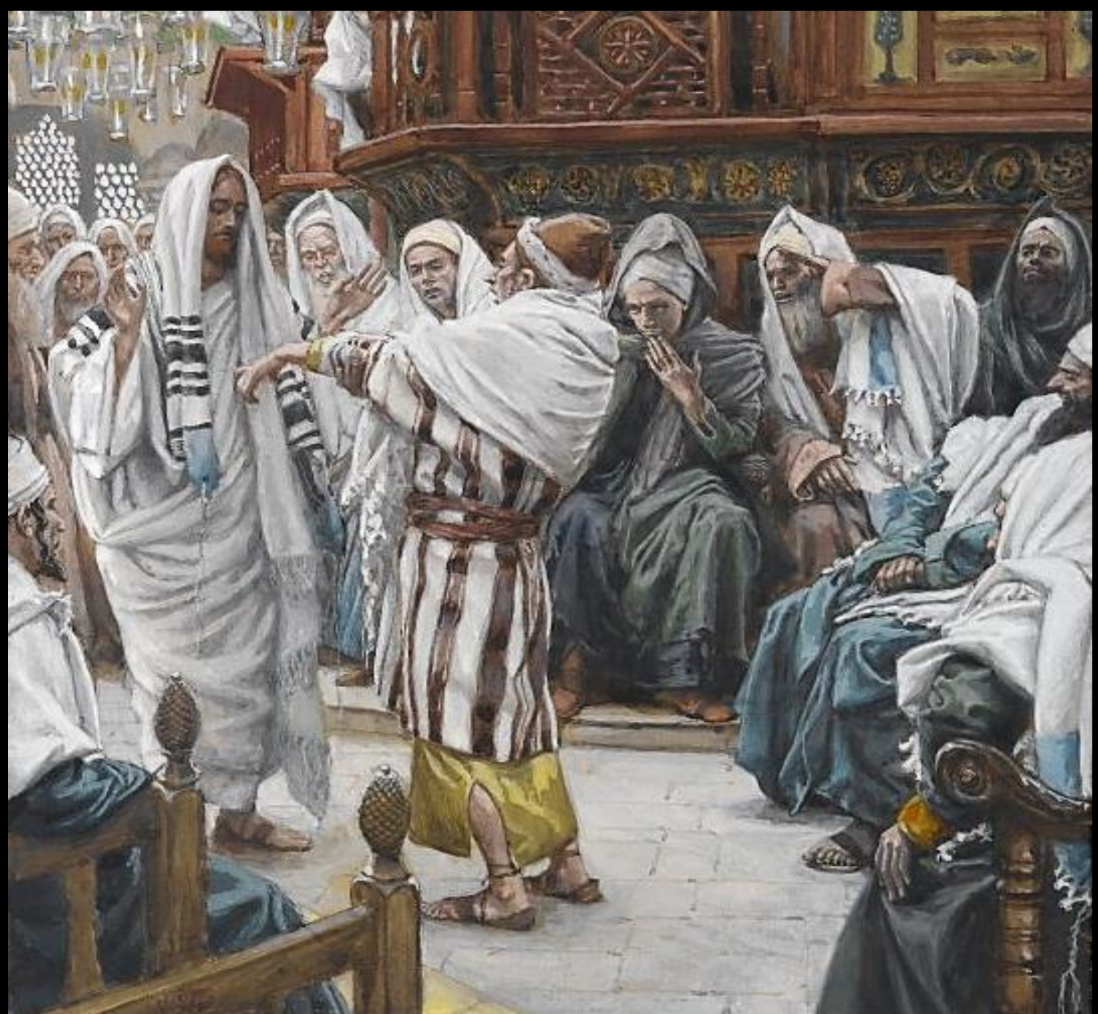
Jesus and the Man with the Withered Hand, detail

James Tissot, Brooklyn Museum of Art New York, NY