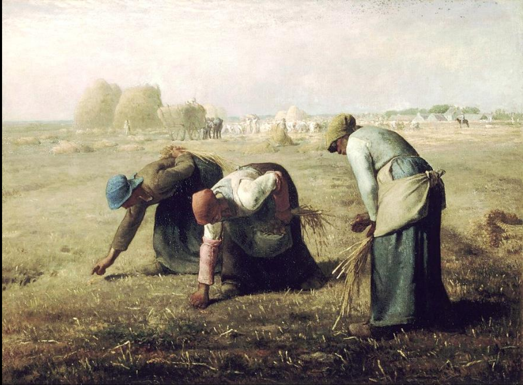
The Gleaners -- Jean Francois Millet, Musée d'Orsay, Paris, France