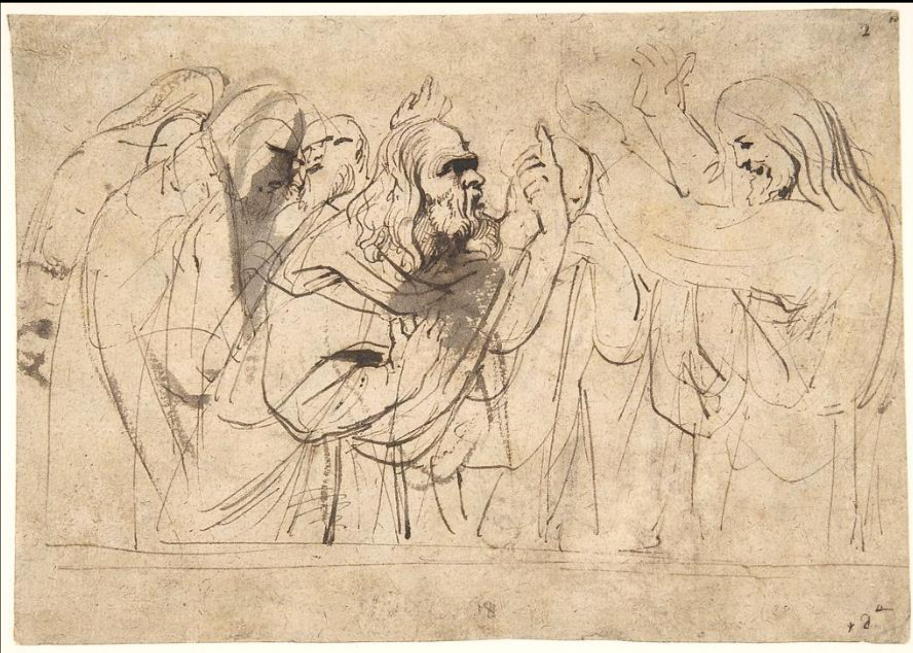
Christ and the Pharisees -- Anthony van Dyck, Metropolitan Museum of Art, NY