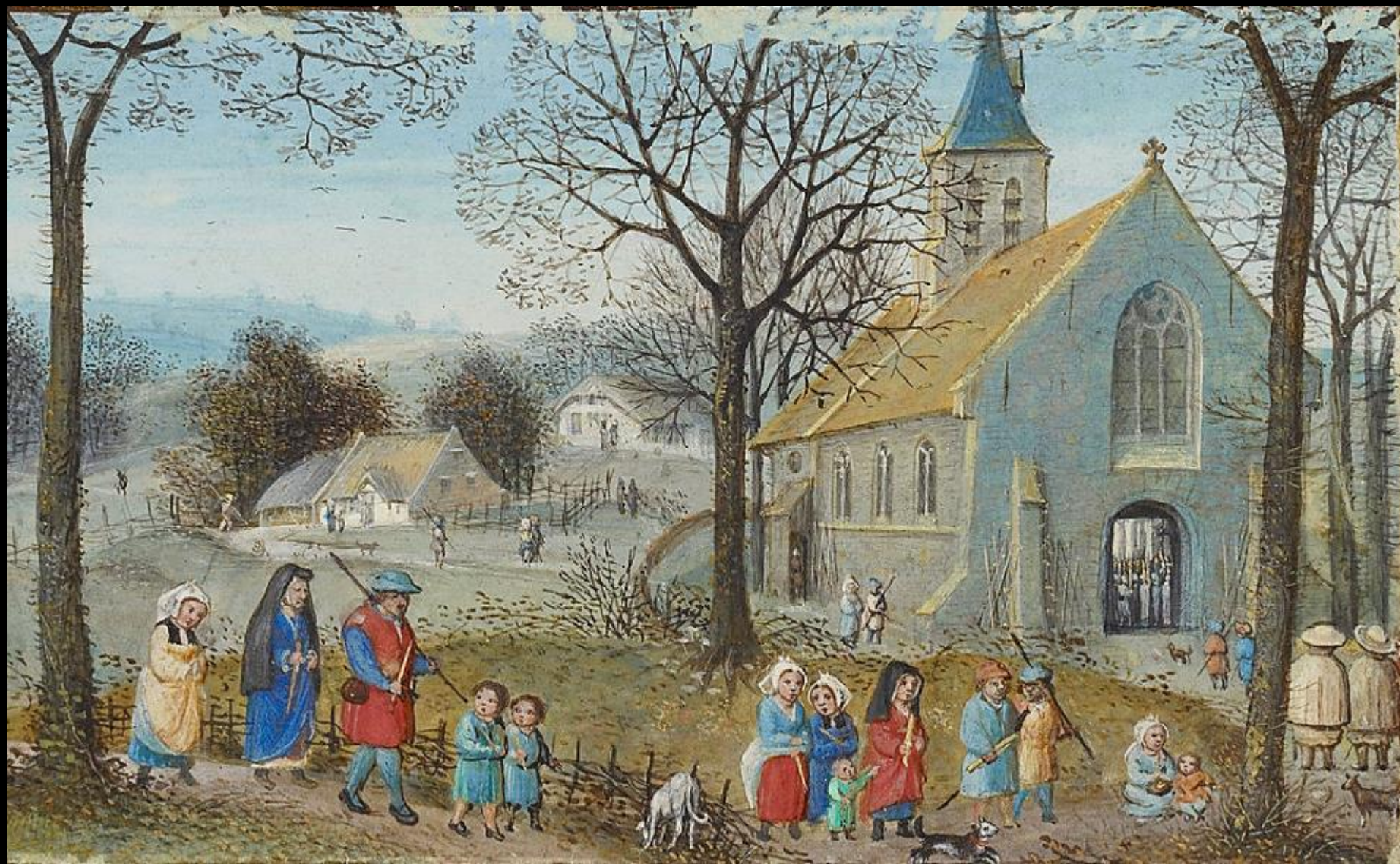
Villagers on Their Way to Church -- Simon Bening, Getty Center, Los Angeles, CA