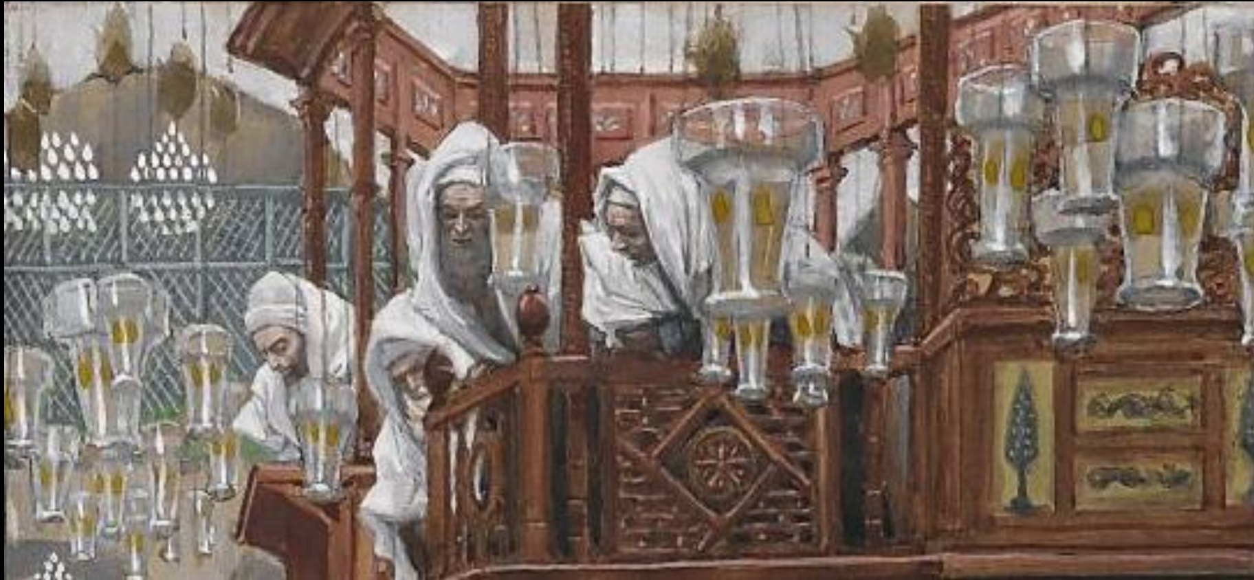
Jesus and the Man with the Withered Hand, detail -- James Tissot, Brooklyn Museum of Art New York, NY