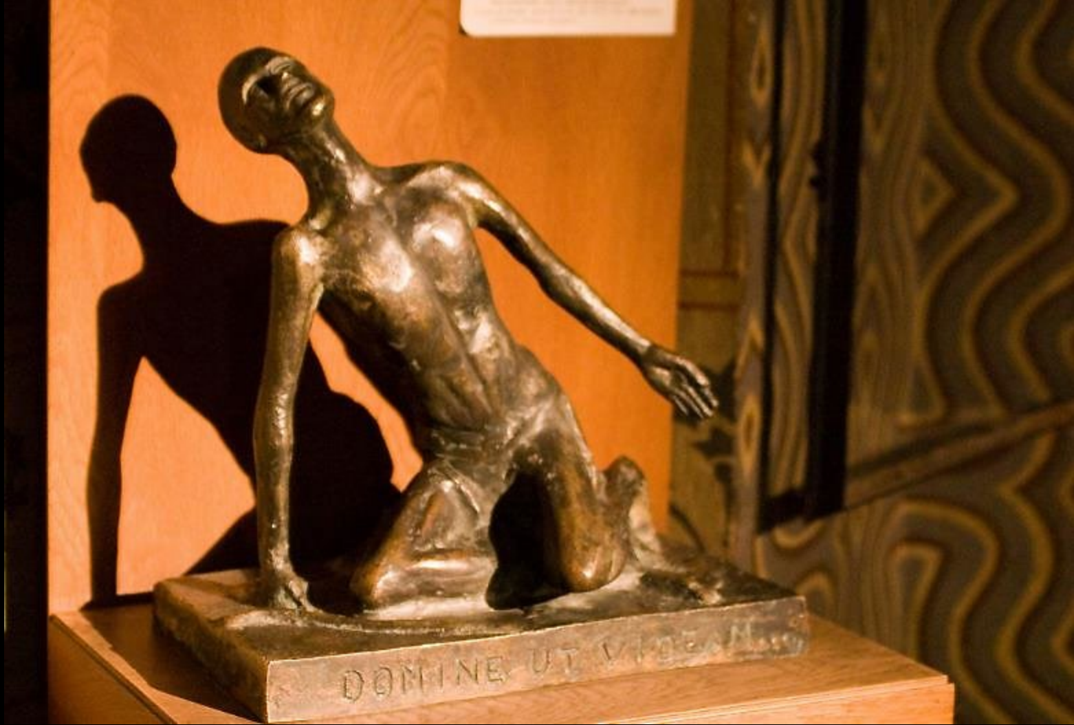
"Lord, That I Might See!" -- Matyas Church, Budapest, Hungary