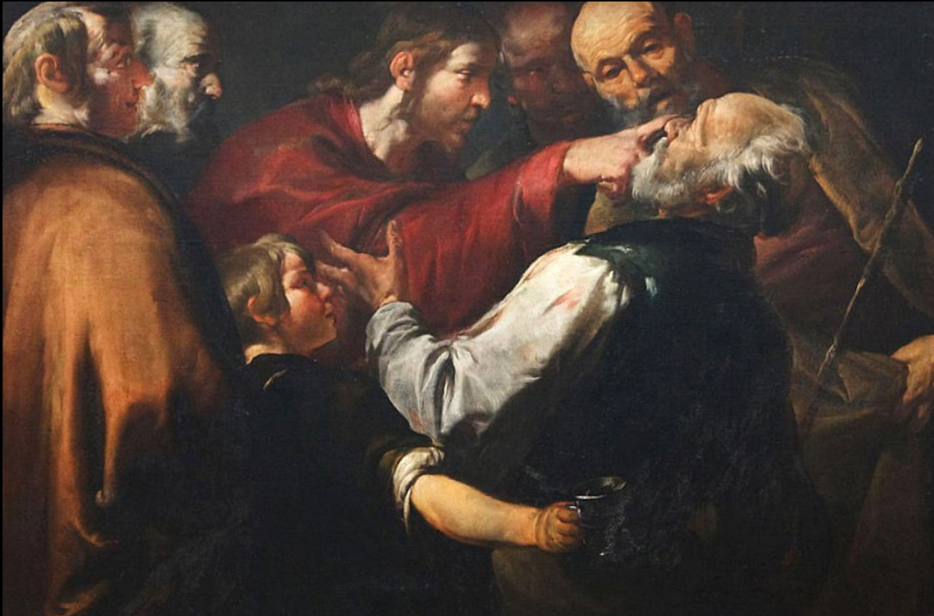
Christ Healing the Blind Man -- Gioacchino Assereto,