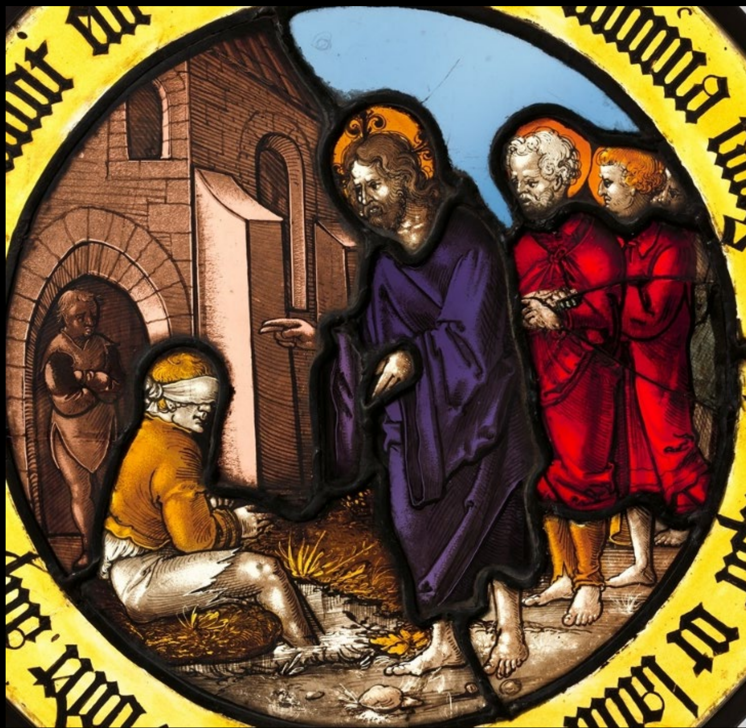
Christ Healing the Blind Man

German, early 16 th c. MET Cloisters New York, NY