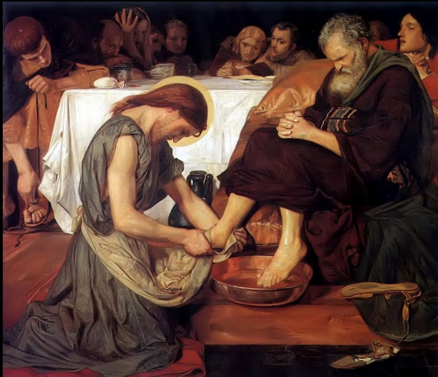
Christ Washes the Disciples' Feet -- Ford Madox Brown, Tate Britain, London, England