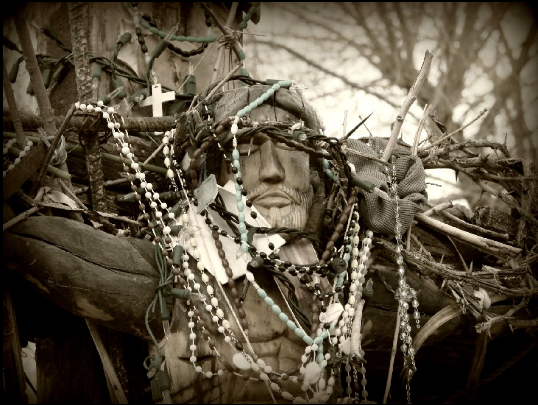
Crucifix -- before 1810, Santuario de Chimayo, Chimayo, NM