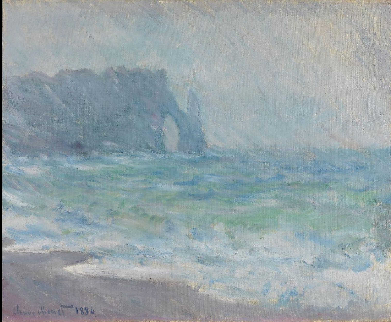
Rain, Étretat -- Claude Monet, National Gallery, Oslo Norway