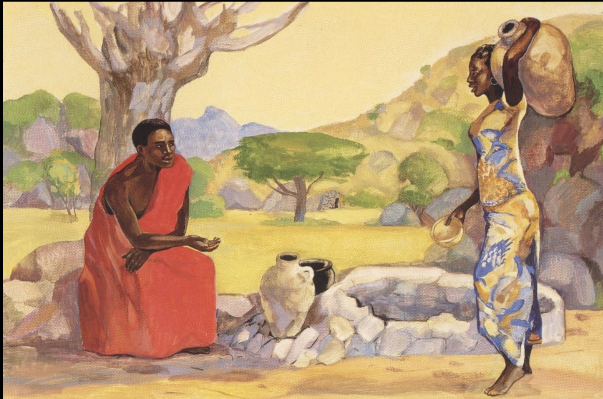
Christ and the Samaritan Woman -- JESUS MAFA, Cameroon