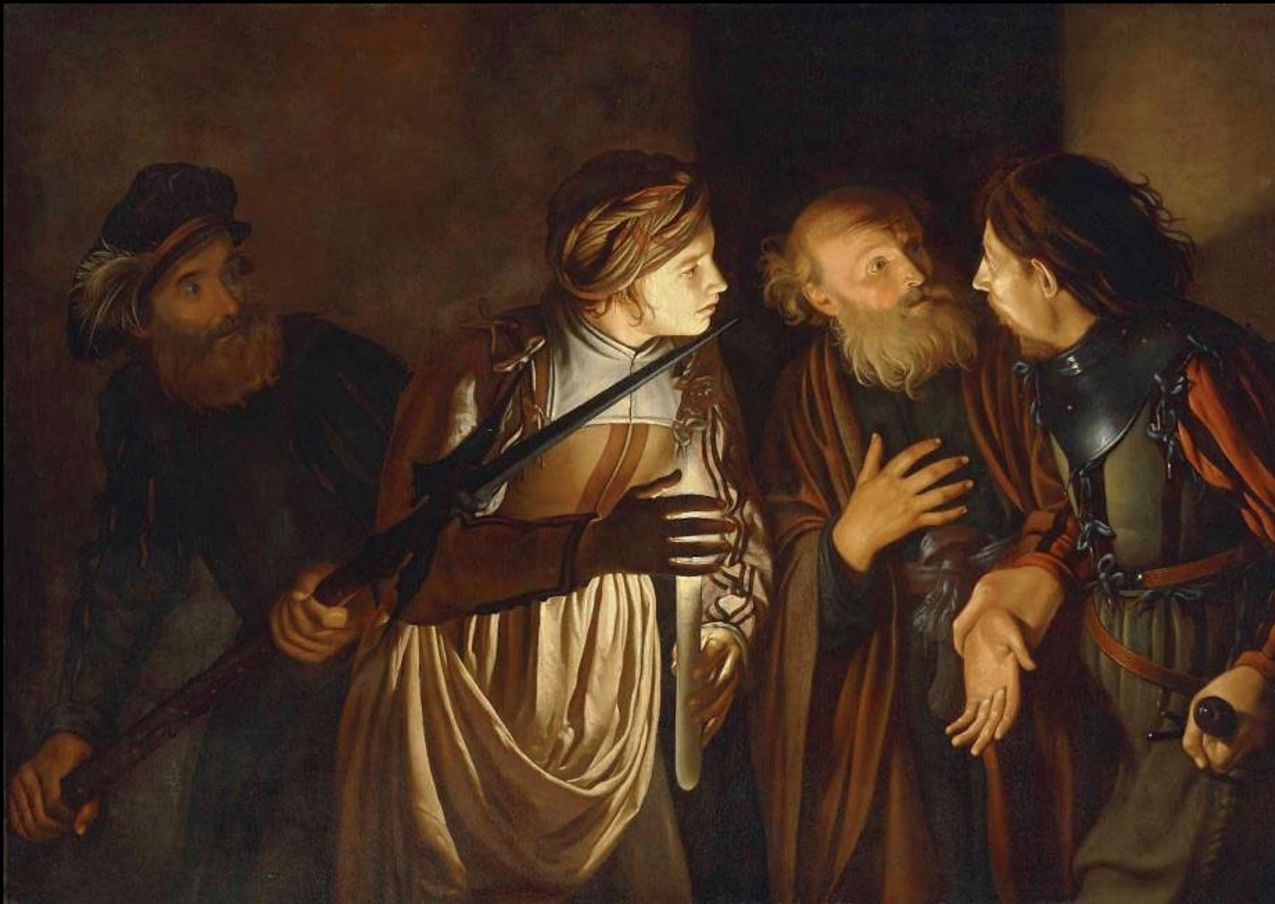
Peter's Denial -- Adam de Coster