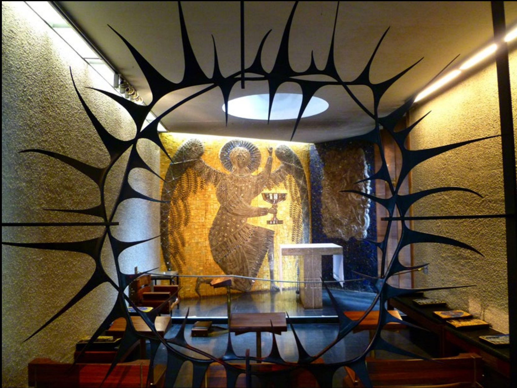
Gethsemane Chapel -- Coventry Cathedral, Coventry, England