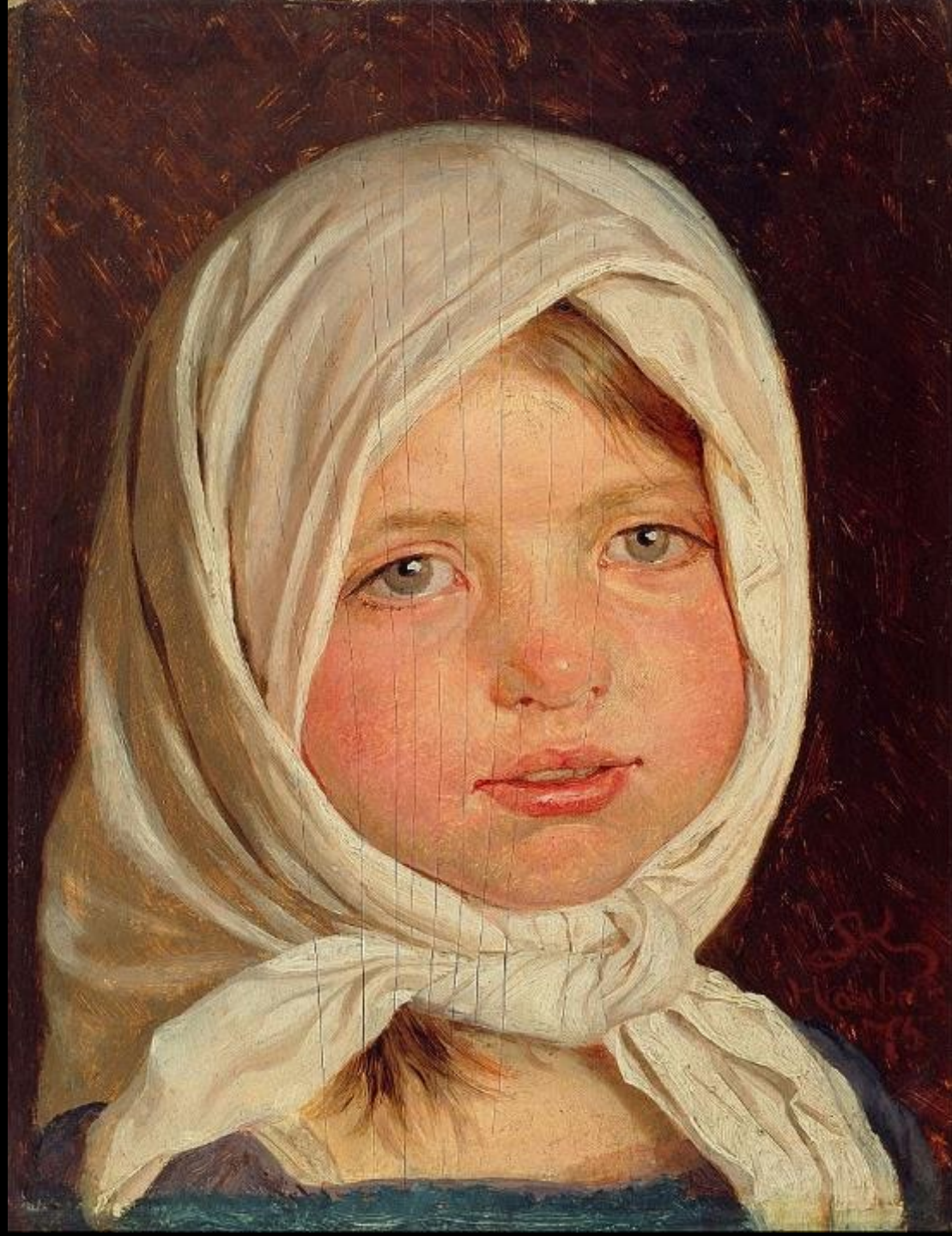
Little Girl from Hornbaeck

Peder Severin Krøyer Hirschsprung Collection Copenhagen, Denmark