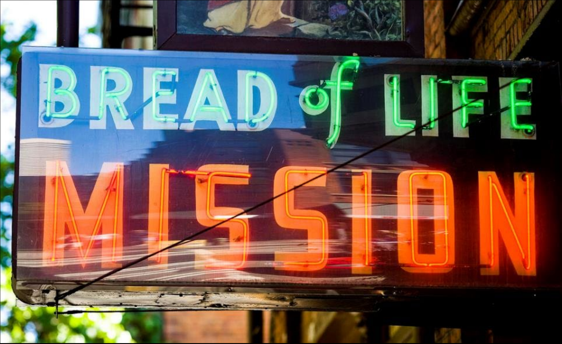
Bread of Life Mission, Seattle, WA