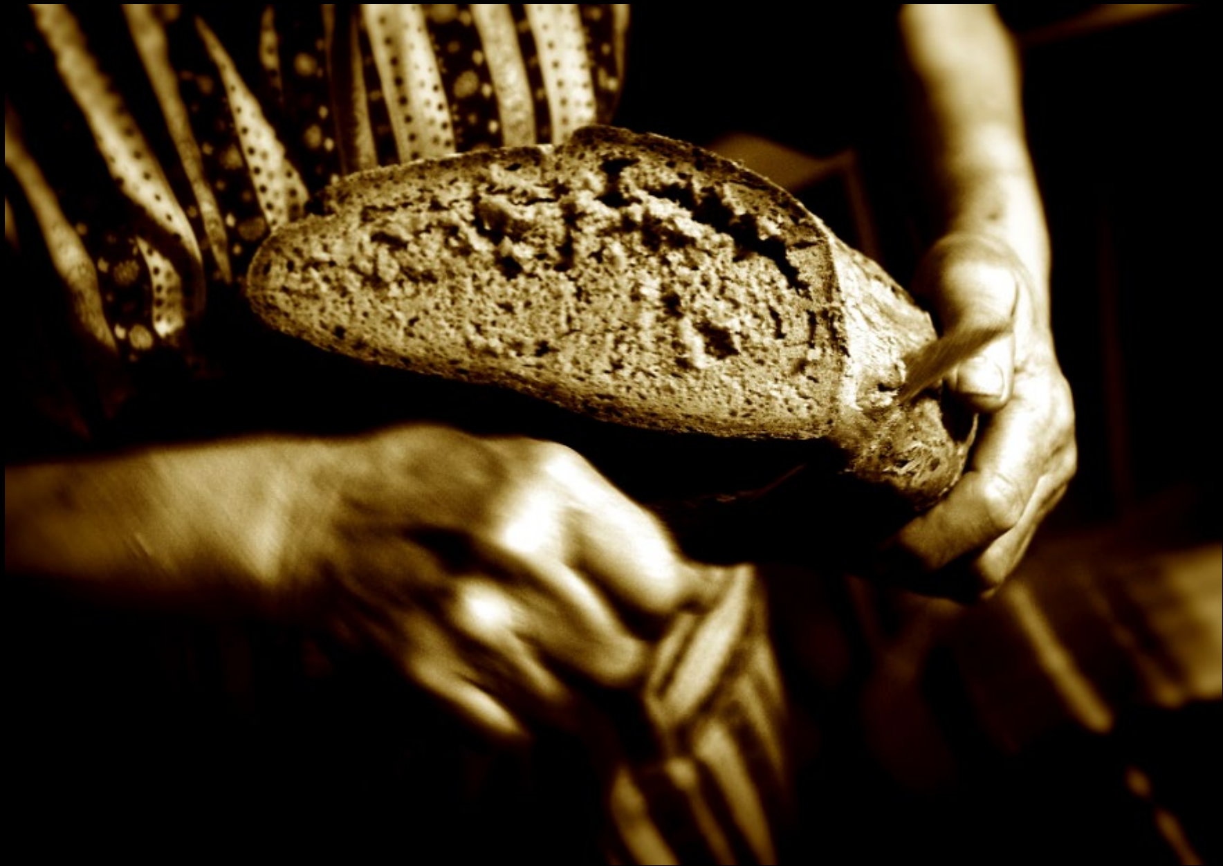
Bread of Life