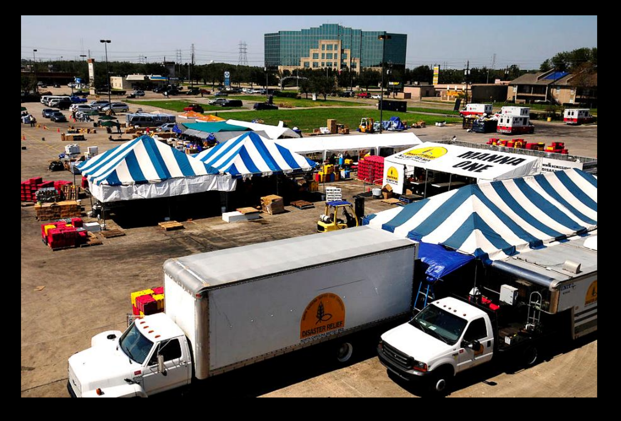
"Manna 1" -- An aerial view of the North Carolina Baptist Men's disaster kitchens, Texas floods