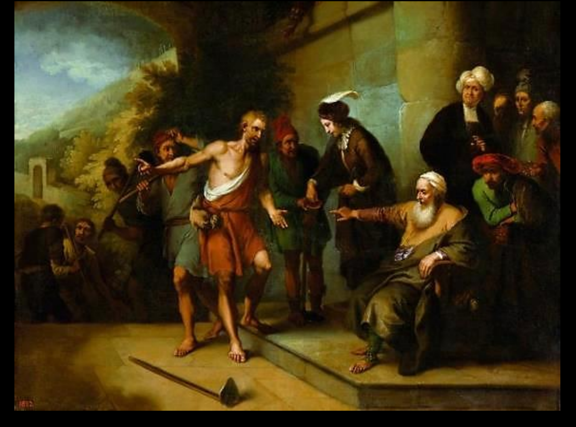
Parable of the Workers in the Vineyard -- Christian Dietrich, Baths Palace, Warsaw, Poland