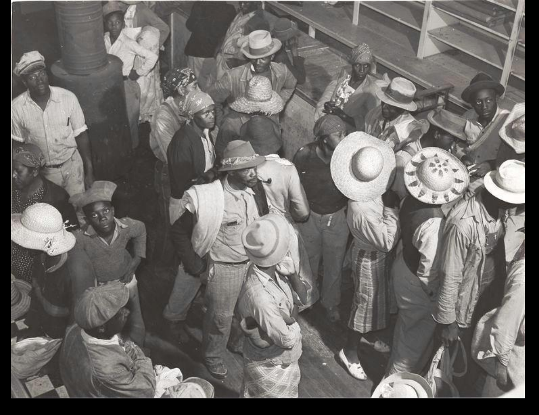
Day Laborers Brought In By Truck From Nearby Towns, 1939 -- Marion Post Wolcott