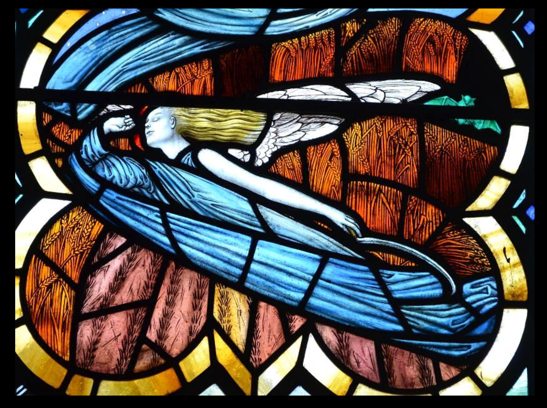
The Reaper -- William Morris & Co., Marden, UK