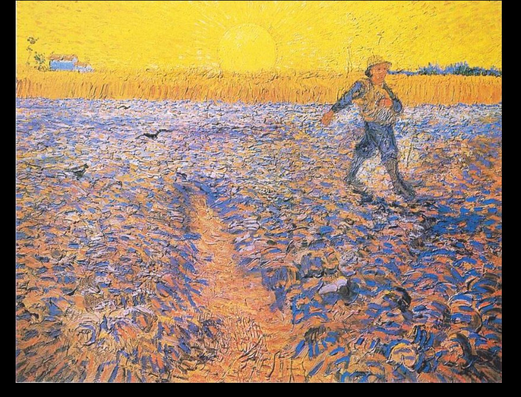
Sower at Sunset -- Vincent van Gogh, Kroller-Muller Museum, Otterlo, Netherlands