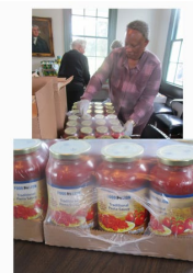
Spaghetti and Sauce