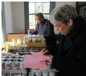
Sorting food for the March harvest